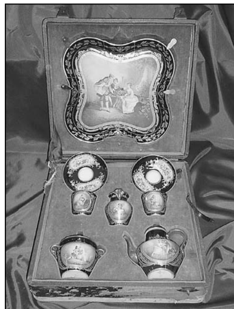
SEVRES TEA SERVICE