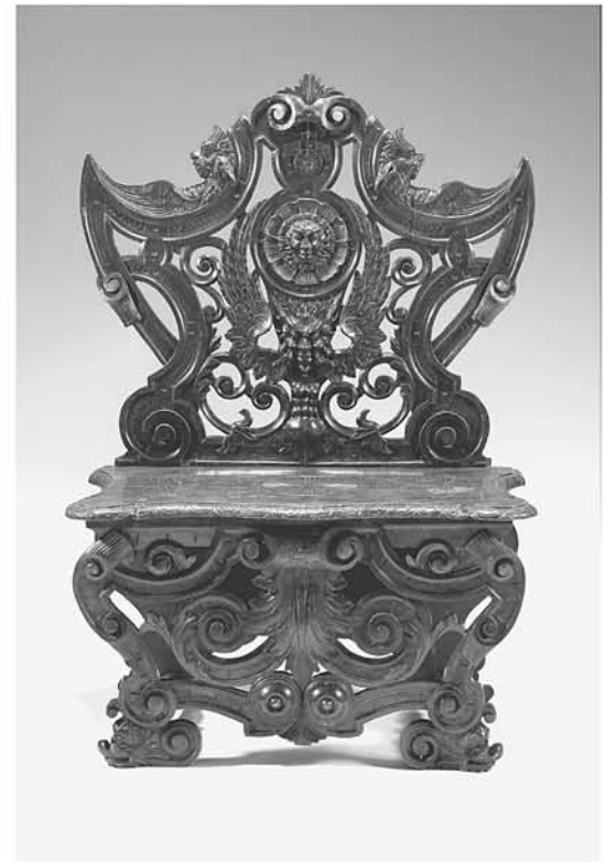
Renaissance Revival carved oak hall bench 19TH CENTURY $250-350

Freeman's 1808 Chestnut Street Philadelphia PA 19103 Tel: 215.563.9275 Fax: 215.563.8236 www.freemansauction.com