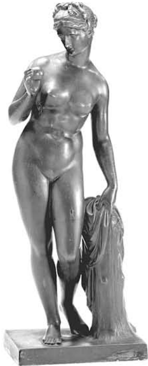
Patinated metal figure of Diana H: 24 3/4 in. $300-500