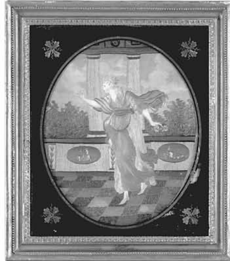
English needlework picture EARLY 19TH CENTURY $400-600