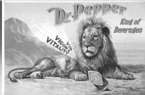
Rare Dr. Pepper paper sign