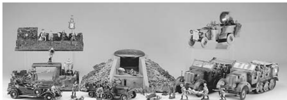
Large single owner collection of German military toys