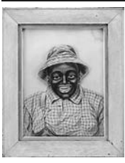
Hoyt's automated picture

Visit our website for more exciting highlights www.jamesdjulia.com