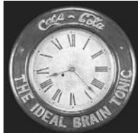
Great Baird clock