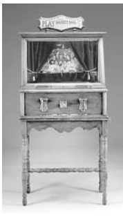
Rare Aeromatic Basketball arcade game

Visit our website for more exciting highlights www.jamesdjulia.com