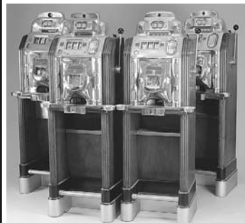
Complete set of 4 Jennings slots