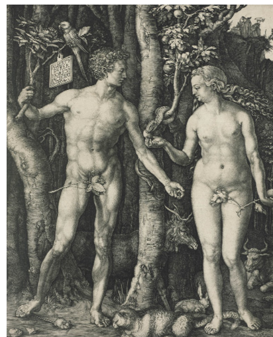
Albrecht Dürer "Adam and Eve," 1504, engraving in black ink on cream laid paper with a watermark of a bull's head (Meder 62), 9 13 / 16 by 7 9 / 16 inches.