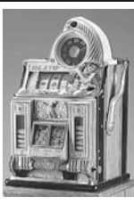
Scarce Rol-a-Top Bird of Paradise