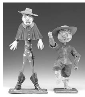
Pair of early papier mache noddors