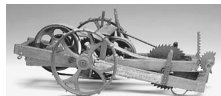
Salesman Sample Gruman's Ice Cutter