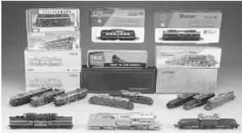
Lg. single-owner coll. of trains