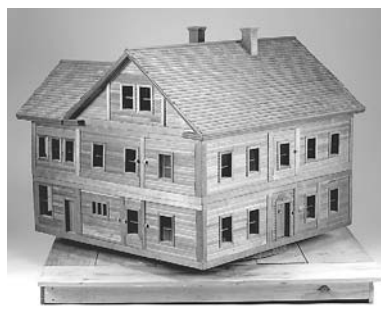
Massive Cape Cod doll's house