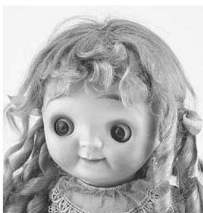
16" Einco Googly