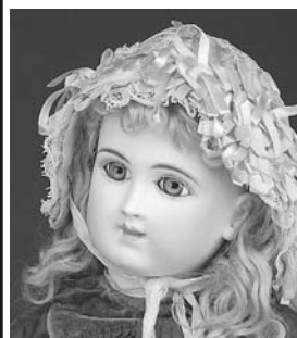
19" Schmitt bebe

James D. Julia, Inc. is pleased to announce our Fall 2009 toy, doll, and advertising auction. This will be a fantastic array of goods gathered from across the United States. Included will be fresh to the market, quality goods for both the beginning and advanced collector. Included will be American and European tin toys, cast iron, pressed steel, fine French and German dolls, trains, scarce coin-op, rare antique advertising items, salesman samples, music machines, and much more. Of particular interest will be a single-owner collection of German military toys and accessories from a Texas collector and a collection of Yellow Kid items from a Midwest collector. Below is only a sampling of the many items to be offered with more items still coming in daily. For more information or to place bids, please contact us today.