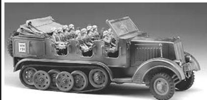
Hausser half-track troop carrier