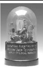
Western Union stock ticker