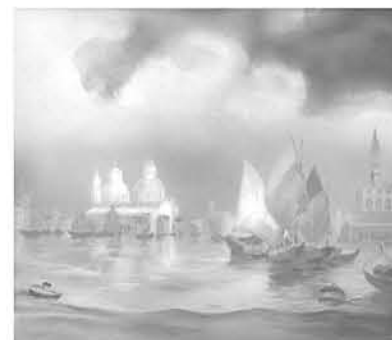
Fred Rothenbush (American, 20th century) Framed painting on vellum plaque, "Sailboats, Venice," 14" x 16"