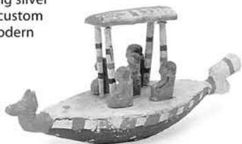
An ancient Egyptian afterlife model boat, 650 - 325 B.C. possibly earlier with five model boatmen, a shade canopy, and a jackal head prow, 17"l