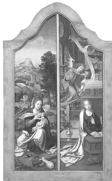
Framed oil on panel diptych, The Annunciation and The Rest on the Flight into Egypt, workshop of Pieter Coecke van Aelst the Elder (Flemish, 1502-1556), 48" x 30"