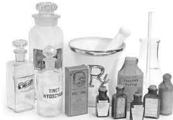
Collection of pharmaceutical jars, bottles, beakers, and boxed medicines (to be offered on Saturday)