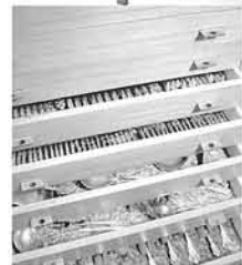
Extensive 350 piece Wallace Grand Baroque sterling silver flatware service, in a custom fitted mid-century modern teak silver chest