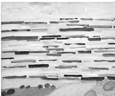
Tadeusz Dominik (Polish, b.1928) Framed oil on canvas, Abstract Landscape, 35" x 43"