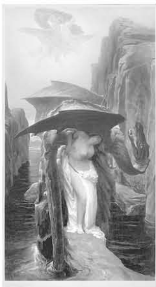
Framed color photoengraving, "Perseus and Andromeda," 1892, by Lord Frederick Leighton (British, 1830-1896), 29" x 16"