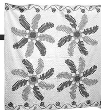
Fine Princess Feather quilt, circa 1860, made by a Virginian family, 81" x 80"