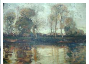
Nunzio Vayana sm. o.b.

Preview Fri 11/6 2 pm to 6:30 pm or by appointment Early bird at 6 pm