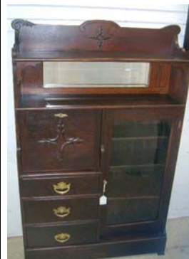
Oak side by side, other furniture

Preview Fri 11/6 2 pm to 6:30 pm or by appointment Early bird at 6 pm