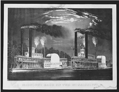
over 100 Currier & Ives