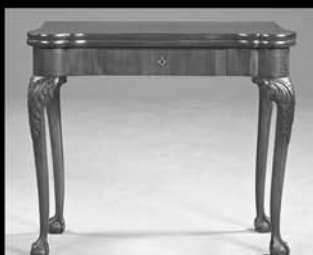
Good American Chippendale Mahogany Fold-Over Games Table, third quarter 18th century