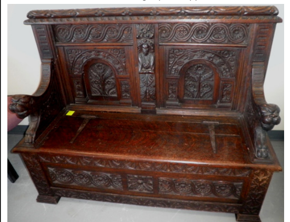
Exceptional Heavily Carved Bench

6pm Early Bird Auction (6pm to 7pm) ~ 100 lots of furniture, collectibles, box lots, table lots, tools, electronics, appliances, etc... 7pm Estate Auction