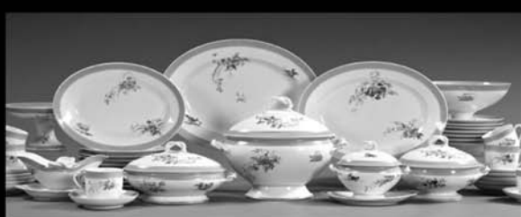
Good Ninety-Two-Piece Set of Haviland and Company Porcelain, third quarter 19th century, Limoges, France