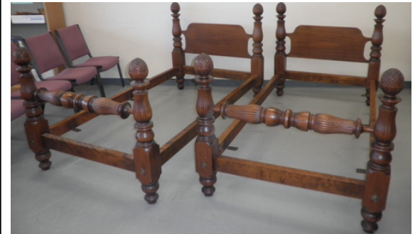
Matched Pair Mahogany Pineapple Beds