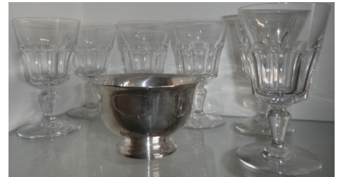
Tiffany and Co Sterling bowl, Baccarat