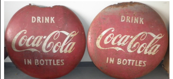
4 ft Coca Cola Advertising Caps