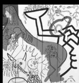
Keith Haring (American, 1958-1990) "Apocalypse #4", screenprint, edition "2/90", signed lower right side "2/90, K. Haring '88". Glazed and framed.