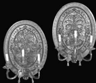
Opulent Pair of Louis XVI-Style Three-Light Appliques, attributed to Maison Jansen, Paris