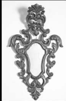
Large Northern Italian Provincial Carved Giltwood Looking Glass, in the Rococo taste, second quarter 19th century