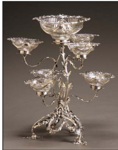
George III Silver Epergne Orlando Jackson, London, 1772 Weight: 105.4 oz $12,000-$18,000