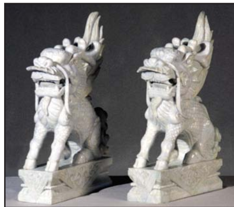
Pair of Chinese Pale Apple-Green and Lavender Jadeite Figures of Temple Lions Post 1950s $2,000-$3,000