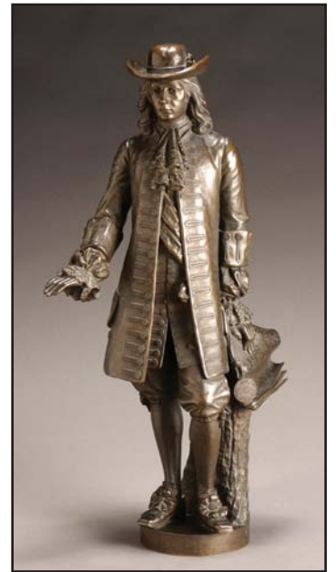
Alexander Milne Calder (American 1846-1923) William Penn Bronze sculpture $5,000-$7,000