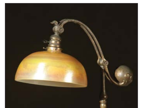
Tiffany Favrite Glass and Bronze Counter-Balance Floor Lamp (detail shown) First Quarter 20th Century $8,000-$12,000