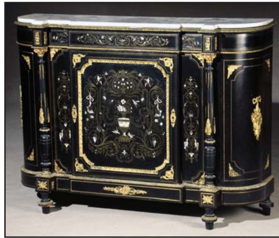
Pair of Napoleon III Ormolu-Mounted Mother-of-Pearl, Ivory and Brass Marquetry Ebonized Wood Side Cabinets (one shown) Circa 1880 $4,000-$6,000