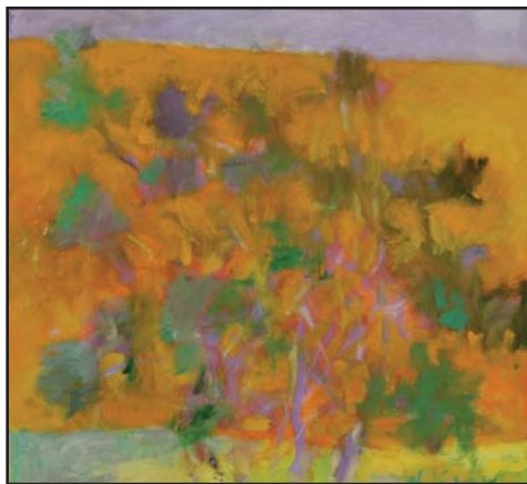
Wolf Kahn (American b. 1927) Orange and Green Oil on canvas $6,000-$8,000