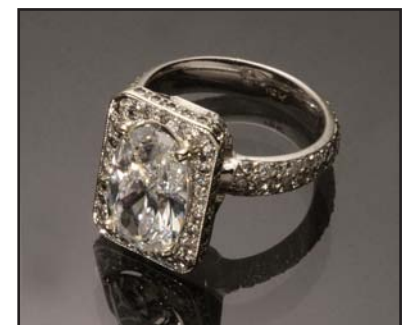
18-Karat White-Gold and Diamond Ring Oval center diamond weighing approximately 3.30 carats $40,000-$60,000 (F color, VVS1 clarity)