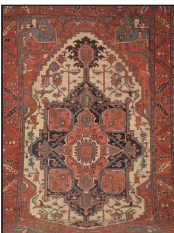
Serapi Rug Circa 1900 15 ft x 9 ft 2 in $7,000-$9,000