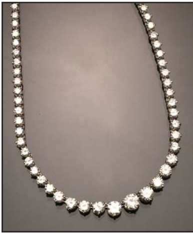
Choker Length Platinum and Diamond Necklace Total weight of diamonds: 14.05 carats $12,000-$15,000