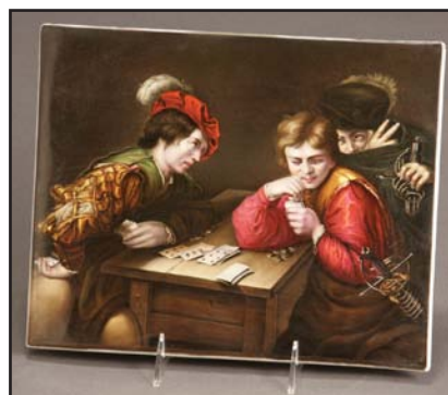
Berlin Porcelain Plaque of 'Der Falschspieler' KPM, Late 19th Century $7,000-$9,000