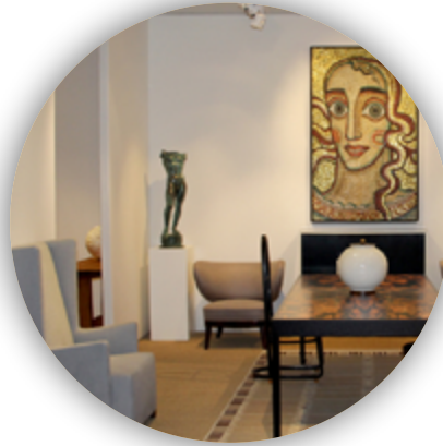
One Hot Ticket: The Salon Of Art + Design