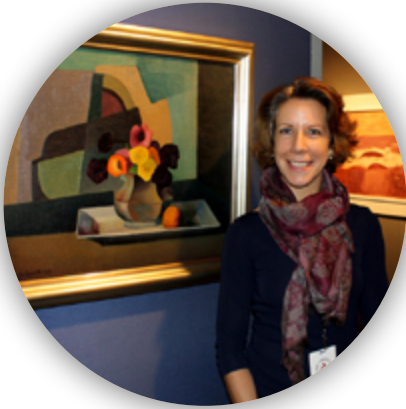
The American Art Fair Draws Record Crowd