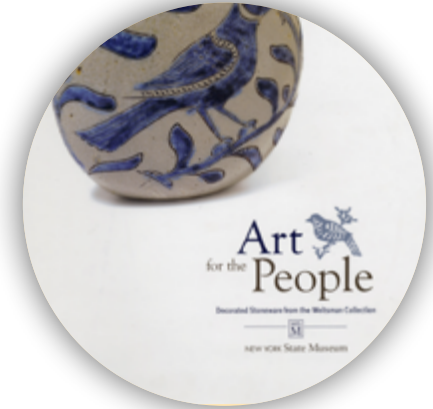
Art For The People: Decorated Stoneware From Weitsman Collection