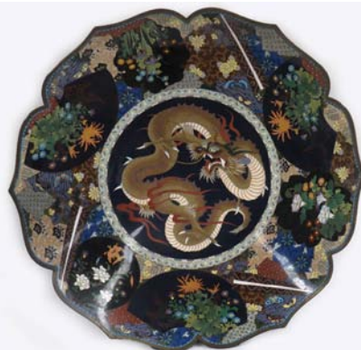
LOT 280. 19TH C. JAPANESE CLOISONNE CHARGER , 24" DIAM.