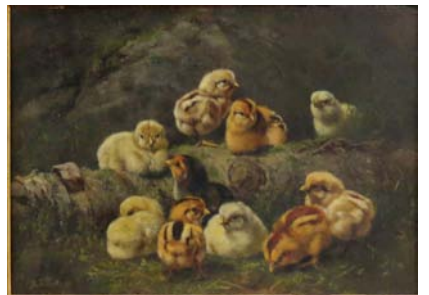
LOT 29. ARTHUR F. TAIT (AM., 1819-1905) SGN. AND DATED 1895, o/p, 10 BY 14 IN.