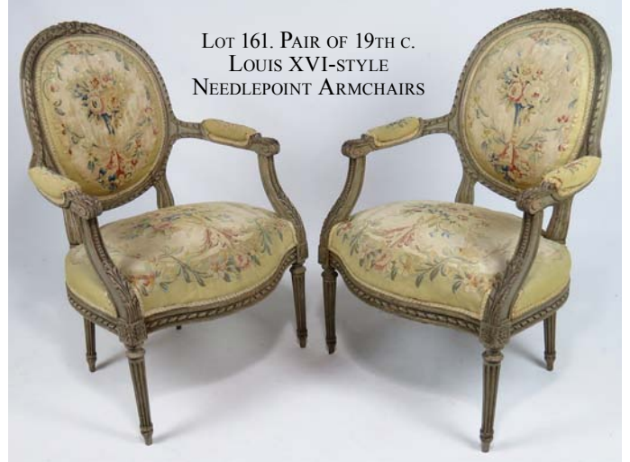
LOT 161. PAIR OF 19TH C. LOUIS XVI-STYLE NEEDLEPOINT ARMCHAIRS