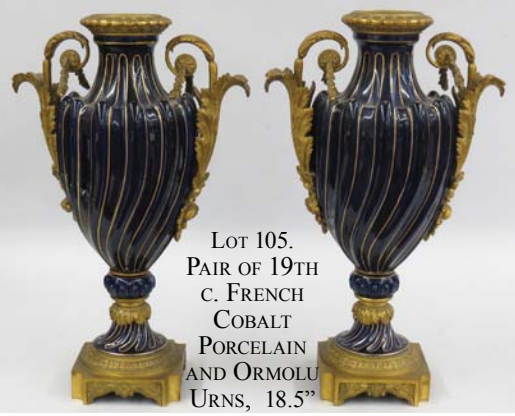
LOT 105. PAIR OF 19TH C. FRENCH COBALT PORCELAIN AND ORMOLU URNS, 18.5"