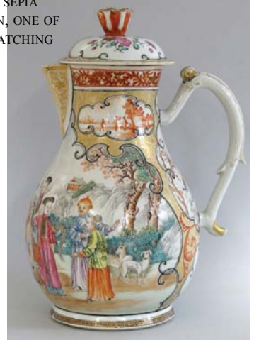
LOT 240. EXCEPTIONAL 18TH C. CHINESE EXPORT COVERED PITCHER, 15”h