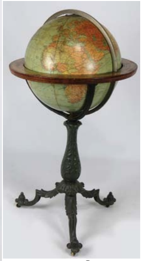
LOT 91. 19TH C. JOHNSTONE TERRESTRIAL FLOOR GLOBE, IRON BASE, 18"DIA.; 44"H