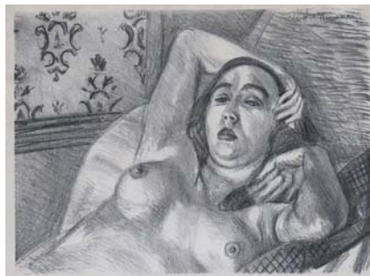
LOT 77. HENRI MATISSE (FR., 1869-1954) LITHOGRAPH, 9 BY 12 IN. (ONE OF TWO)