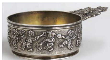
LOT 186. TIFFANY STERLING CHILD’S PORRINGER