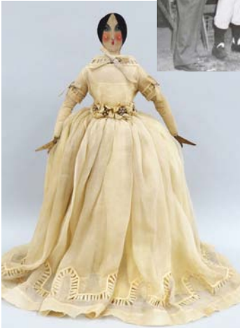
(LEFT) LOT 308. RARE 1921 JEANNE LANVIN STUDIO DISPLAY MANNEQUIN, 21"