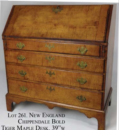
LOT 261. NEW ENGLAND CHIPPENDALE BOLD TIGER MAPLE DESK, 39”w