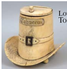
LOT 231. FOLKART WHALEBONE TOBACCO BOX, 4"