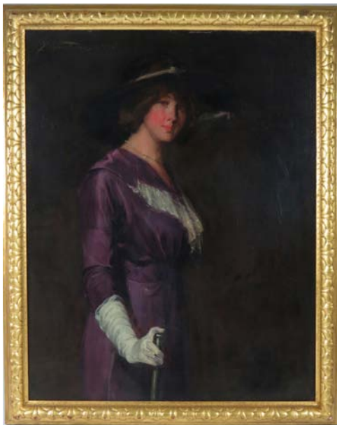
LOT 30. CHARLES W. HAWTHORNE (AM., 1872-1930) o/c, 41 BY 33 IN.