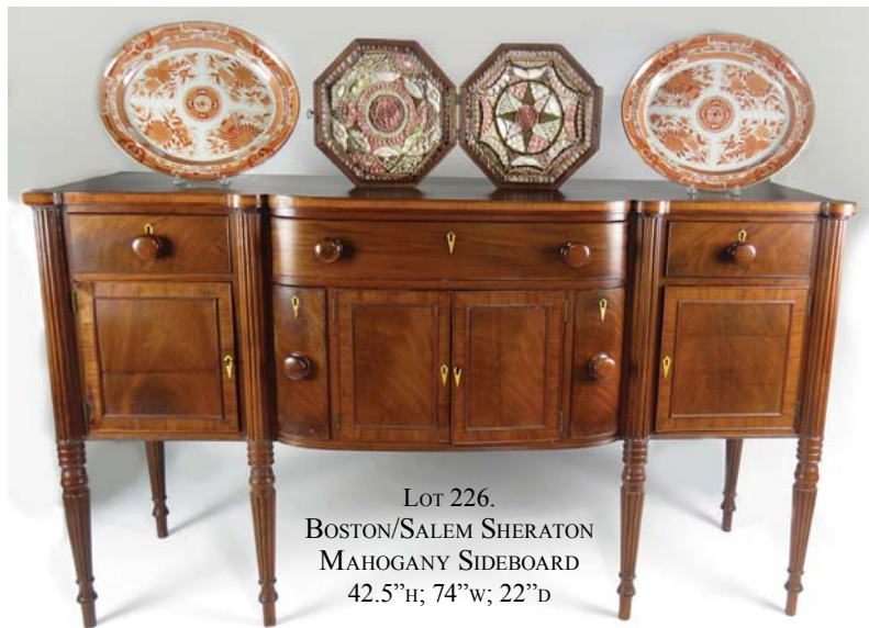
LOT 226. BOSTON/SALEM SHERATON MAHOGANY SIDEBOARD 42.5”h; 74”w; 22”d