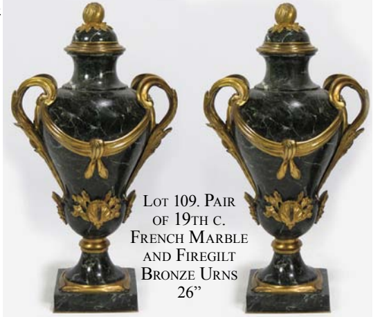
LOT 109. PAIR OF 19TH C. FRENCH MARBLE AND FIREGILT BRONZE URNS 26"