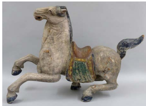
LOT 338. LARGE CHINESE CARVED AND POLYCHROMED HORSE , 39" LONG