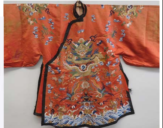
LOT 333. DRAGON ROBE, ONE OF SEVERAL CHINESE NEEDLEWORKS