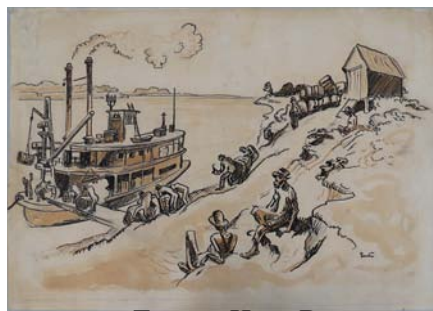
LOT 63. THOMAS HART BENTON (AM., 1889-1975) INK AND SEPIA WASH ON PAPER, 10 BY 14.75 IN.