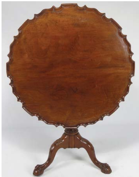
LOT 255. PHILADELPHIA CHIPPENDALE MAHOGANY TEA TABLE, C. 1770, 35”DIAM.