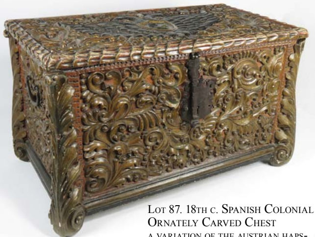
LOT 87. 18TH C. SPANISH COLONIAL ORNATELY CARVED CHEST A VARIATION OF THE AUSTRIAN HAPS-BURG CREST TO TOP 30"H; 50.5"W; 27"D