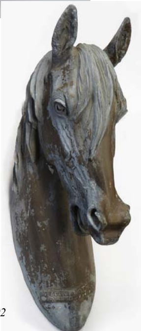
LOT 126. 19TH C. LIFE-SIZED ZINC HORSE HEAD, FLEISCHMANN & CO., NEW YORK, 32"