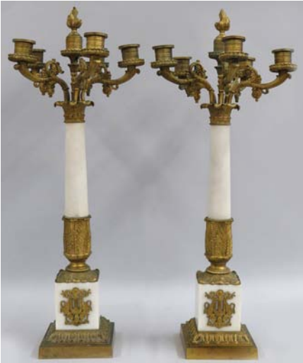
LOT 164. 19TH C. FRENCH MARBLE AND ORMOLU CANDELABRA, 26"