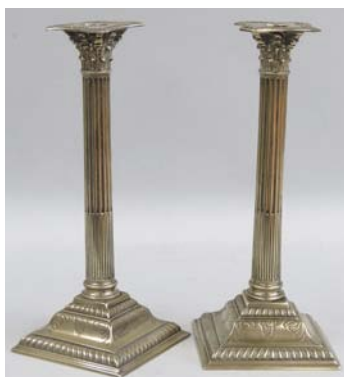
LOT 181. PAIR OF GEORGE III PAKTONG CANDLESTICKS, 11.5"