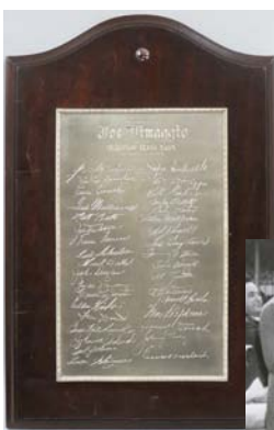
LOT 96. JOE DIMAGGIO STERLING SILVER PLAQUE PRESENTED BY THE BOSTON RED SOX AT YANKEE STADIUM ON JOE DIMAGGIO DAY, OCTOBER 1, 1949. ENGRAVED WITH SIGNATURES OF THE 1949 RED SOX ROSTER.