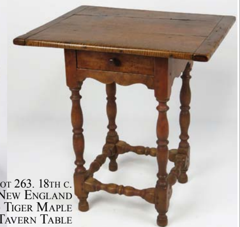
LOT 263. 18TH C. NEW ENGLAND BOLD TIGER MAPLE TAVERN TABLE 26”h; TOP 24” BY 20”

GO TO OUR WEBSITE FOR ON-LINE CATALOGUE: www.crnauctions.com