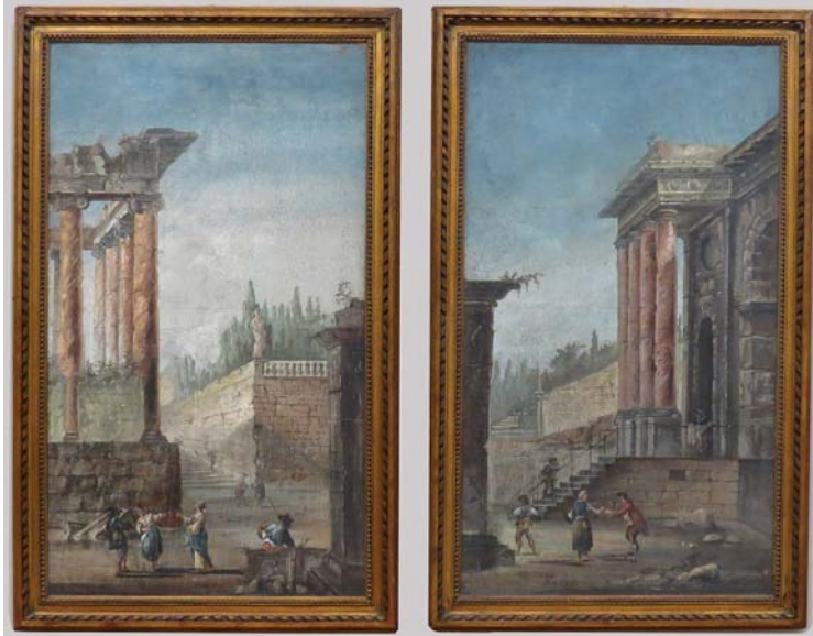
LOT 48. (PAIR) ITALIAN, 18/19TH C. SCHOOL OF FRANCESCO GUARDI o/c, EACH 50.5 BY 29 IN. LOT 89. 17/18TH C. SPANISH CARVED WALNUT REFRACTORY TABLE 67"LONG; 31"D