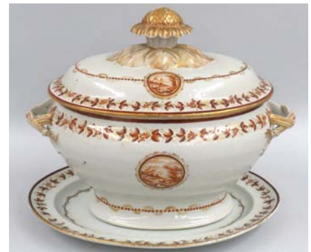
LOT 244. CHINESE EXPORT ARMORIAL SOUP TUREEN W/ SEPIA DECORATION, ONE OF SEVERAL MATCHING LOTS