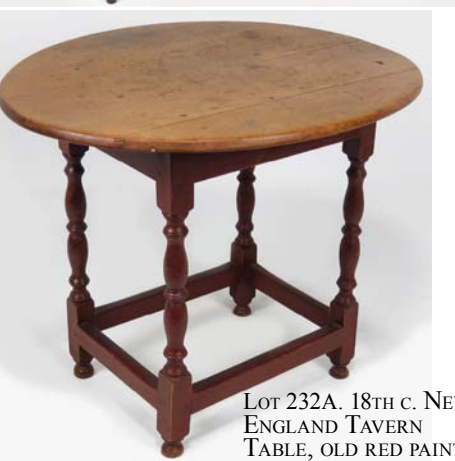
LOT 232A. 18TH C. NEW ENGLAND TAVERN TABLE, OLD RED PAINT, SCRUBBED TOP 25”h; 31”w