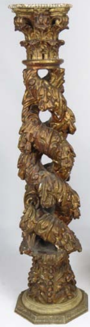
LOT 93. PAIR OF ENGLISH REGENCY SATINWOOD STANDS, 28"H; 16"DIA. (RIGHT) LOT 130. PAIR OF ITALIAN ROCOCO CARVED GILTWOOD PEDESTALS, 52"