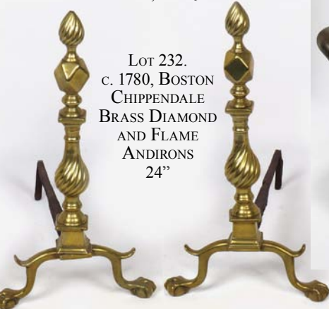
LOT 232. C. 1780, BOSTON CHIPPENDALE BRASS DIAMOND AND FLAME ANDIRONS 24”