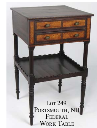
LOT 249. PORTSMOUTH, NH FEDERAL WORK TABLE 29”h; 16”sq