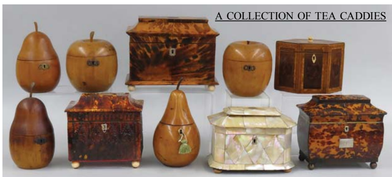
A COLLECTION OF TEA CADDIES

GO TO OUR WEBSITE FOR ON-LINE CATALOGUE: www.crnauctions.com