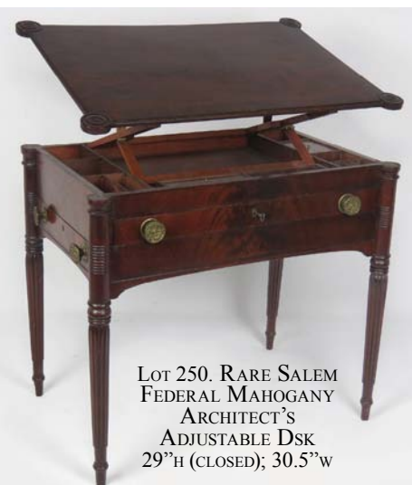
LOT 250. RARE SALEM FEDERAL MAHOGANY ARCHITECT’S ADJUSTABLE DSK 29”h (CLOSED); 30.5”w