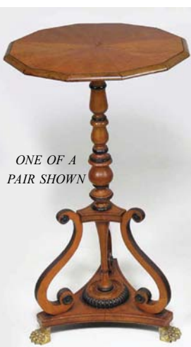
ONE OF A PAIR SHOWN