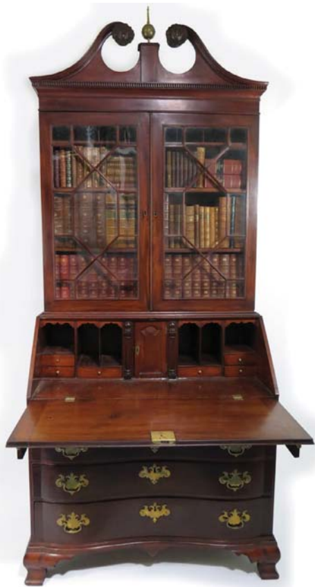
LOT 225. SALEM CHIPPENDALE MAHOGANY OX-BOW SECRETARY/BOOKCASE, 93.5”h; 41”w