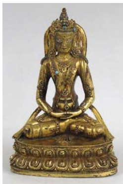
LOT 326. SINO-TIBETAN GILT BRONZE BUDDHA , 7"