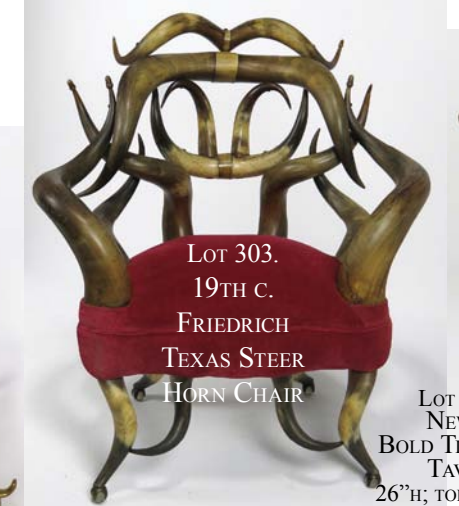
LOT 303. 19TH C. FRIEDRICH TEXAS STEER HORN CHAIR