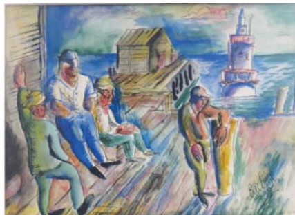
LOT 34. DAVID D. BURLUIK (AM./UKRAINIAN, 1882-1967) WATERCOLOR, 10 BY 14 IN.