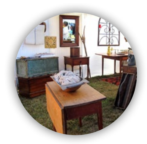
New London Garden Club Celebrates 50th Antiques Show