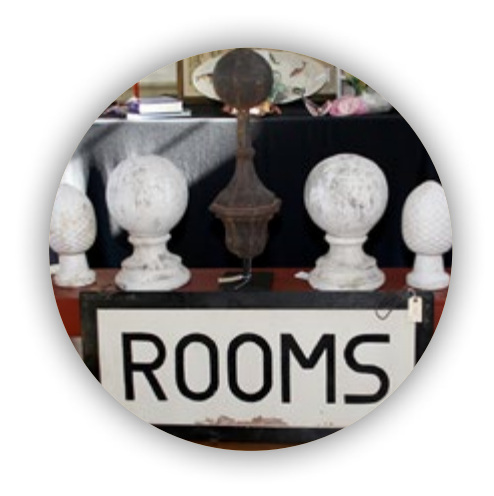
Play's The Thing At Tiverton Four Corners Show