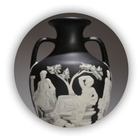
Skinner Succeeds With Wedgwood