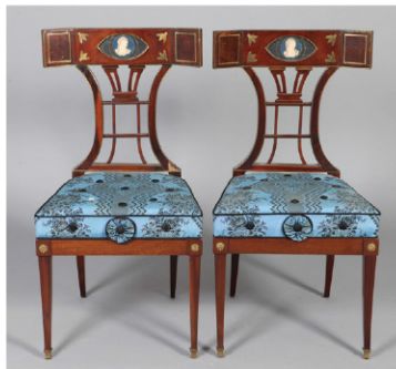
Pair Scandinavian Neoclassical Sidechairs