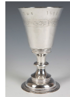
Extremely Rare Elizabeth I Silver Chalice, made London, 1568-69