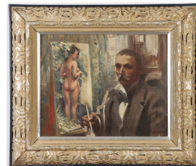
ANDERS ZORN (Swedish, 1860-1920). Self-Portrait of Artist Painting Nude