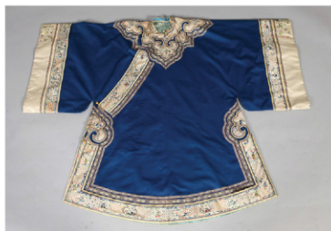
Chinese Embroidered Robe