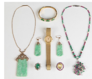
Part Collection Estate Jewelry