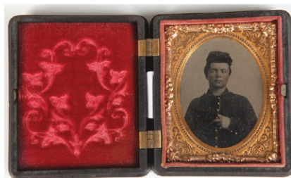
Daguerrotype Depicting Union Soldier