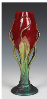
Zsolnay Eosin Art Nouveau Tulip Vase