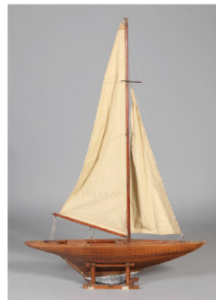
Hand-Crafted Hickory And Other Wood Pond Yacht. Made in 1920s as a model of an America's Cup racing yacht