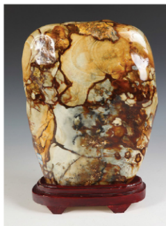
Chinese Scholar's Stone

EXHIBITION: Saturday, February 13 - Thursday, February 18