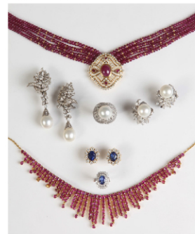
Part Collection Estate Jewelry