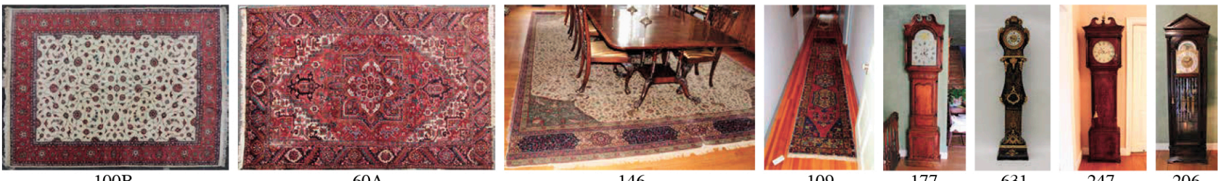
100B 60A 146 109 177 631 247 206