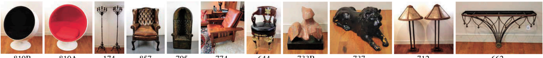
810B 810A 174 857 795 774 644 733B 737 712 662