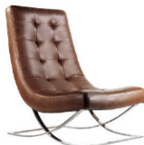
Mies Van Der Rohe Style Lounge Chair Brown Leather.