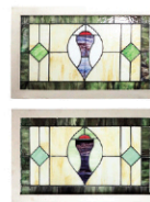
Matched Pair Stain Glass Leaded Transit Windows