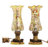
2 Unusual Enameled Glass Shade Moser Style Table Lamps