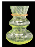
Kosta Boda Kjell Engmann Yellow Glass Gourd Shape Vase