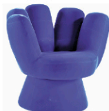
Blue Velvet Upholstered HAND CHAIR