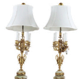
Pair High Quality Bronze Electric Candelabrum Lamps