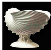
WEDGWOOD Conch Shell Bowl Etruria & Barlaston