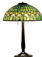
Tiffany Studios NY Pomegranate Lamp Signed Shade & Base