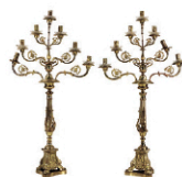
Pair 19th C. French Empire Bronze 7-Light Candelabras