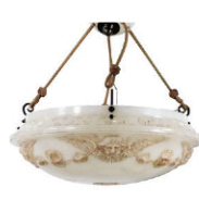
Circa 1920s Alabaster Theater Dome Chandelier, carved Cherubs faces