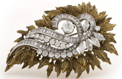
Vintage Platinum & 18K Diamond Detachable Brooch