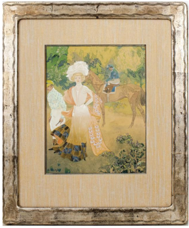
Georges de Feure "Longchamps" Gouache, 1905