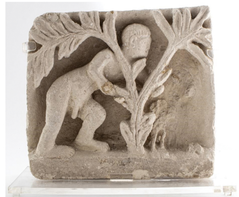
Ancient Byzantine Egyptian Coptic Limestone Relief