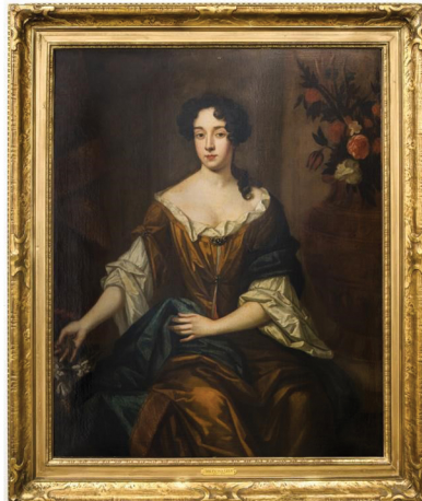
Sir Peter Lely Attributed Portrait of a Noblewoman