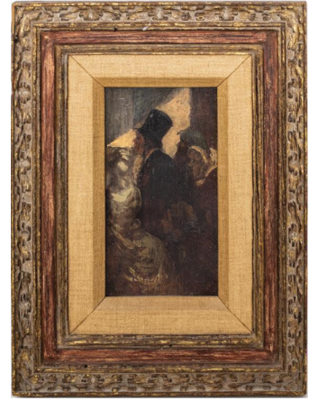
Honoré Daumier Attributed Oil on Panel