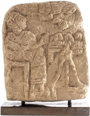
Ancient Hittite Limestone Round-Topped Stela