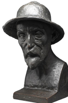
Aristide Maillol Portrait of Auguste Renoir Bronze