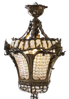
Tiffany Studios Attr. Turtle Back Glass Chandelier

OUR NEW PREVIEW SPACE IS OPEN 10am - 6pm Wednesday to Sunday