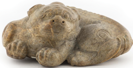
Chinese Song Dynasty Carved Jade Model Of A Pixiu