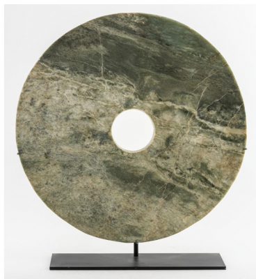
Chinese Neolithic Period Liangzhu Jade Bi Disc