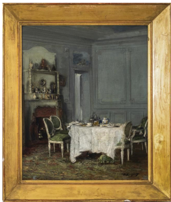
Bergeret "Interior of a Dining Room" Oil on Canvas