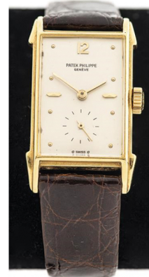
Rare Patek Philippe 18K Gold Watch, Late 40's