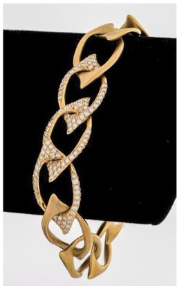
Angela Cummings 18K Gold Diamond Link Bracelet