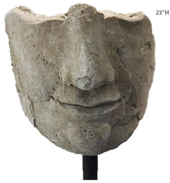
Monumental Sukhothai Stucco Buddha Head