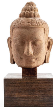
Khmer Sandstone Buddha Head Sculpture