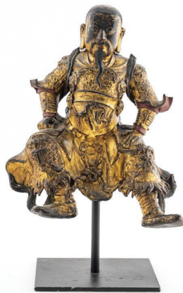
Chinese Ming Dynasty Gilt Bronze Guandi