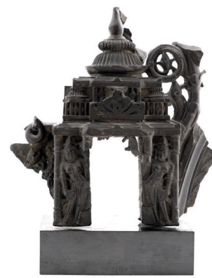
Indian Stone Temple Facade Fragment, 10th-12th C