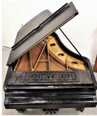
Hardman New York Grand Piano