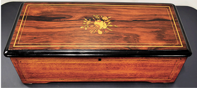
8Tune Music Box (1)