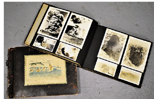
Vintage Hawaiian Albums