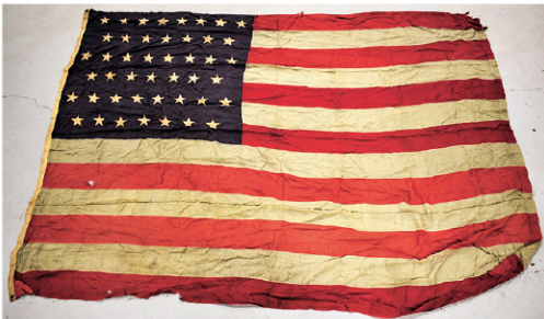
Alert Hose No. 1