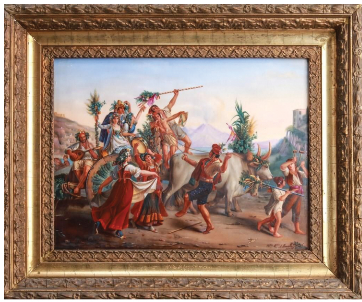
KPM Porcelain Plaque, Le Retour de Pelerinage