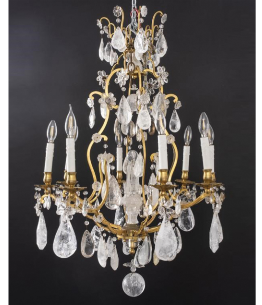
French Louis XVI Style Rock Crystal Chandelier