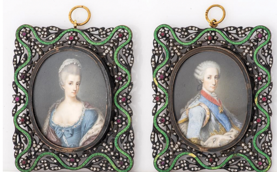
18K Gold Silver Diamond Ruby Framed Portraits