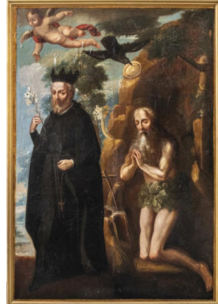
Monumental Italian Old Master Oil, 17th C.