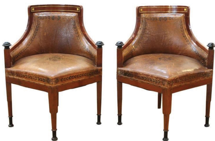
Antique Russian Empire / Baltic Desk Chairs