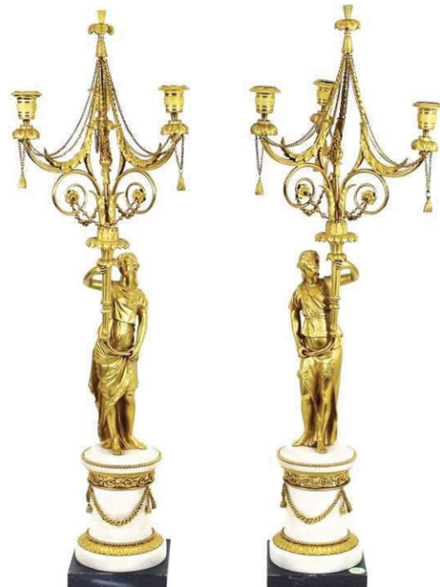
French Louis XVI Ormolu & Marble Candelabras