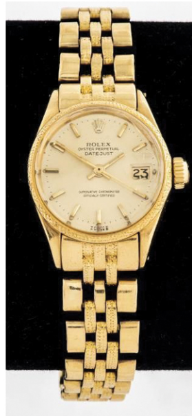
Vintage 18K Gold Rolex Ladies DateJust Watch