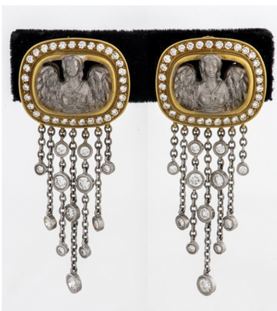
Kieselstein-Cord 18K Angel Diamond Drop Earrings