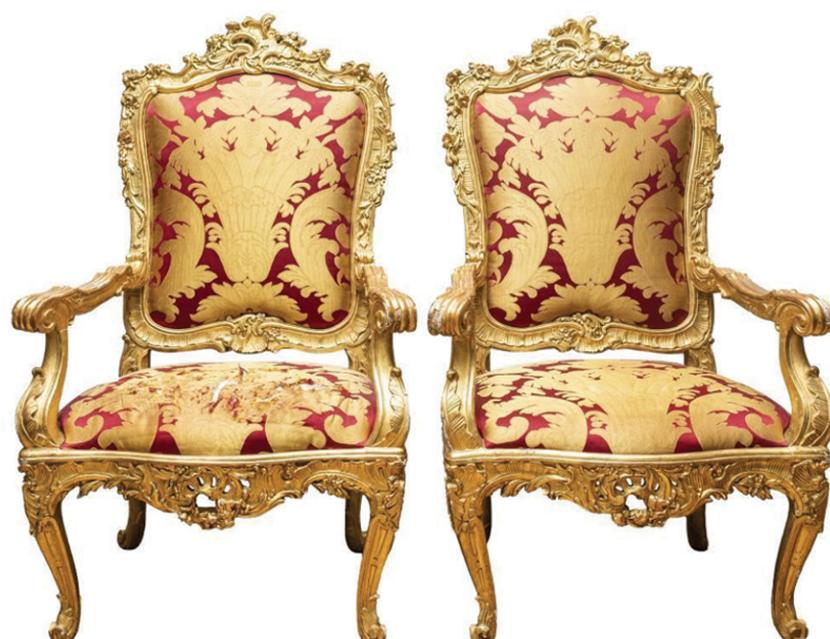
Fine & Rare Italian Rococo Giltwood Armchairs