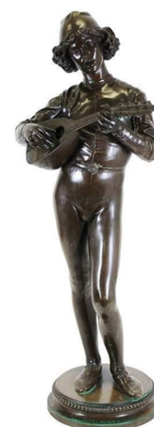
P. Dubois Barbedienne 'Florentine Singer' Bronze