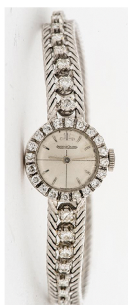
Jaeger Le Coultre 18K Gold Diamond Ladies Watch