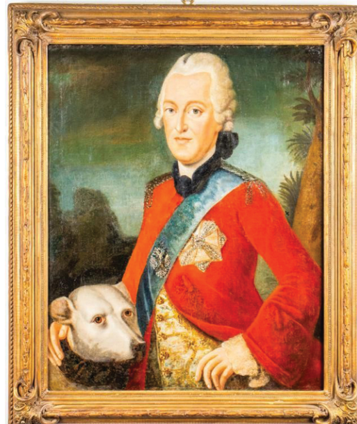
Russian School Portrait Order of St Andrew, 18th C