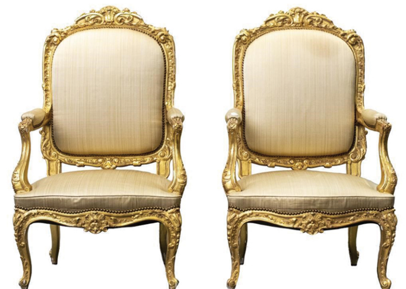
North Italian Baroque Giltwood Fauteuils