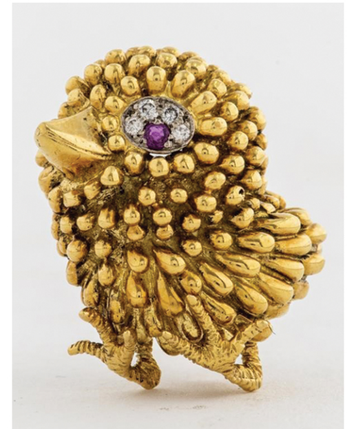
Kutchinsky 18K Gold Diamond & Ruby Eye Bird Brooch

OUR NEW PREVIEW SPACE IS OPEN 10am - 6pm Wednesday to Sunday