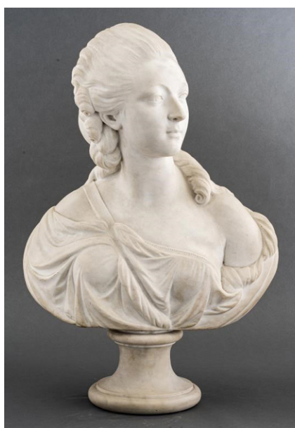
After Pajou 'Comtesse Du Barry' Marble Bust