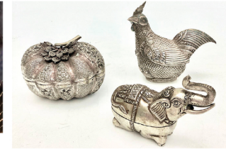
PART COLLECTION SOUTHEAST ASIAN SILVER ANIMAL-FORM BOXES