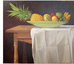
EDGAR SOBERON (Cuban, born 1962). Barca Verde II , 2000