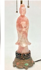
CHINESE CARVED ROSE QUARTZ FIGURE MOUNTED AS LAMP