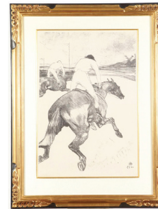
HENRI DE TOULOUSE-LAUTREC (French 1864 - 1901). Le Jockey (The Jockey) , 1899