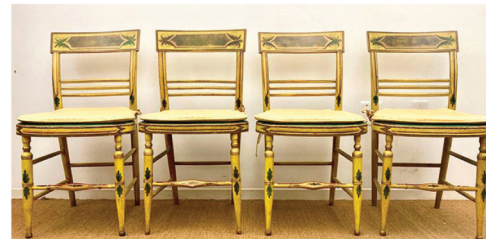
SET FOUR AMERICAN YELLOW FANCY PAINTED CHAIRS