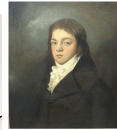
HENRY ROBERT MORLAND (English, 1716 - 1797). Portrait of George Morland When a Young Man , circa 1780