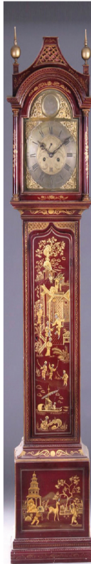
GEORGE III RED AND GILT-PANNED TALL CASE CLOCK

SLOANS & KENYON Auctioneers and Appraisers