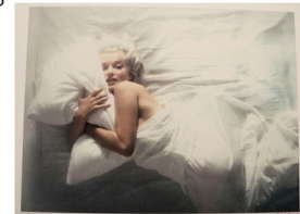
DOUGLAS KIRKLAND (American, born 1934). Portfolio of six Marilyn Monroe photographs , 1961