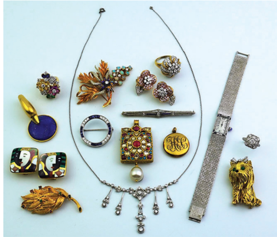
PART COLLECTION ESTATE JEWELRY

Absentee, Telephone and Internet Bids Accepted