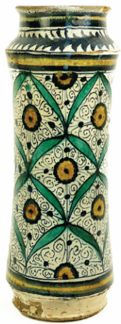
ITALIAN MAIOLICA ALBARELLO 15TH C. 12.5” SACKLER COLLECTION