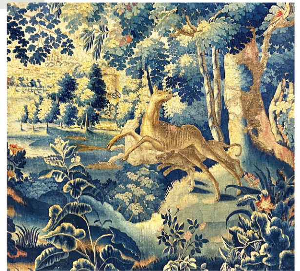
(PARTIALLY SHOWN) 17TH C. FLEMISH VERDURE TAPESTRY 10 FT. BY 8 FT. 6 IN.