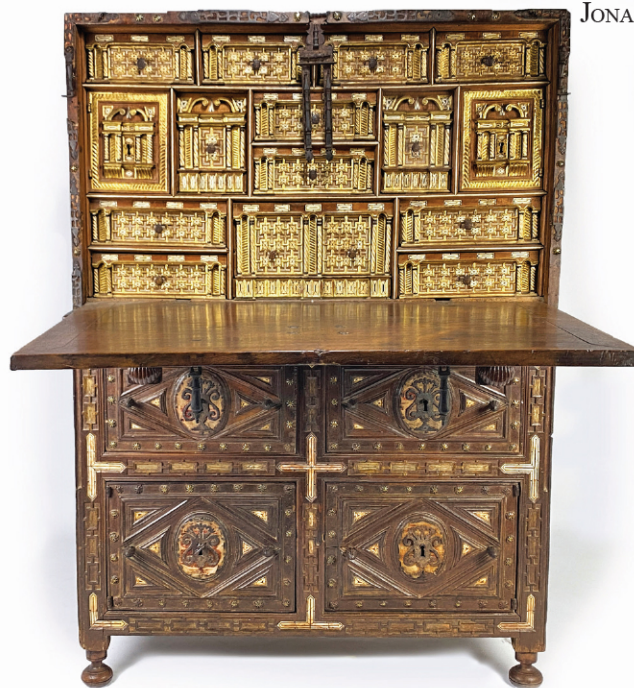
SPANISH BAROQUE VARGUENO/TAQUILLON ONE OF NINE VARGUENOS BEING SOLD