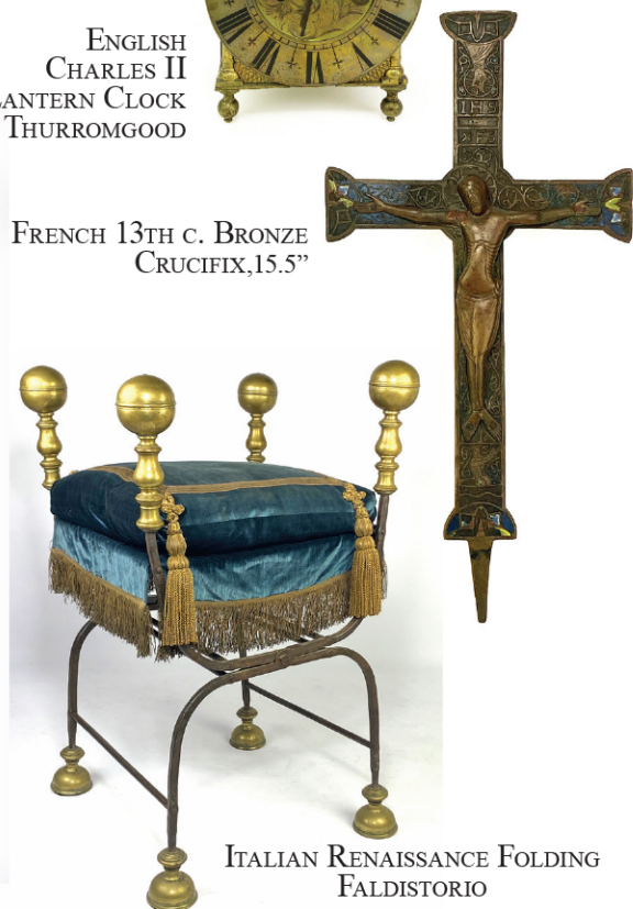
ITALIAN RENAISSANCE FOLDING FALDISTORIO

CRN AUCTIONS, INC., 57 Bay State Road, Cambridge, MA 02138