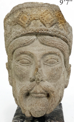
FRENCH GOTHIC LIMESTONE BUST, 9"