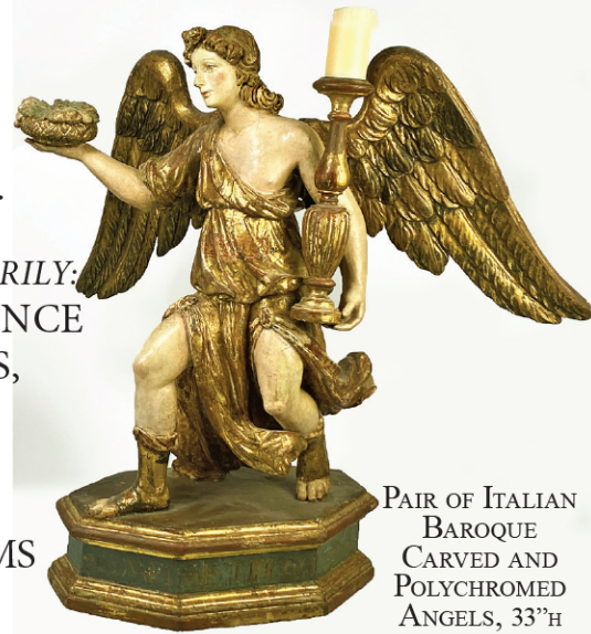
PAIR OF ITALIAN BAROQUE CARVED AND POLYCHROMED ANGELS, 33”H