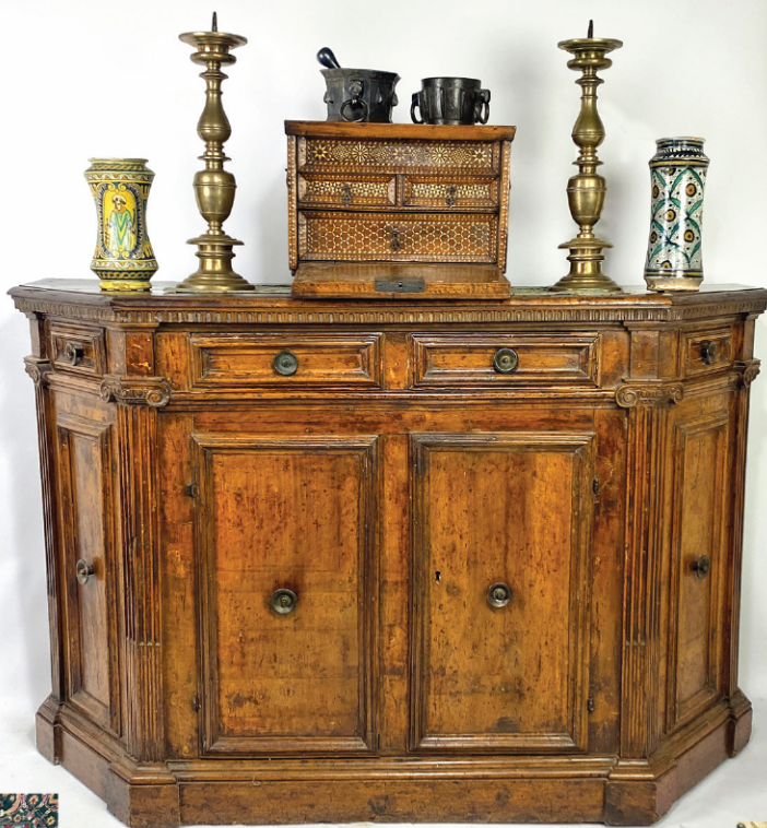
ITALIAN RENAISSANCE WALNUT CREDENZA