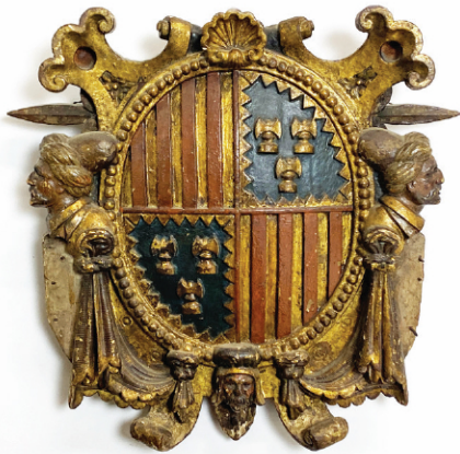
SPANISH BAROQUE CARVED AND POLYCHROMED SHIELD, 26”H; 26”W