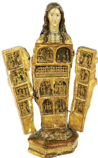
15TH C. CONTINENTAL VIERGE OUVRANT SHRINE, 10”