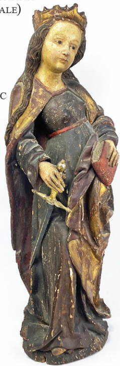
15TH C. GERMAN SAINT CATHERINE, 34"