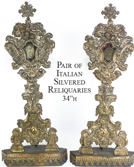
PAIR OF ITALIAN SILVERED RELIQUARIES 34"H