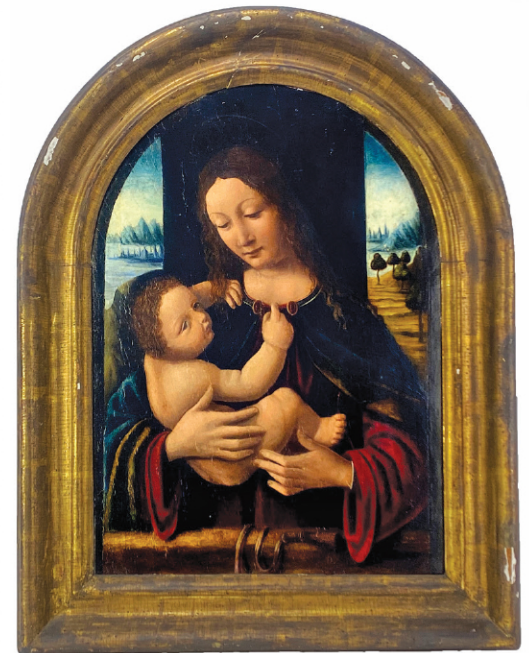
CIRCLE LEONARDO DA VINCI ITALIAN, 16TH C. O/CRADLED PANEL, 22 BY 16 IN.