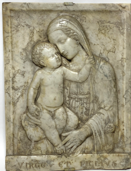
ITALIAN RENAISSANCE MARBLE RELIEF 21.5 BY 15.5 IN.