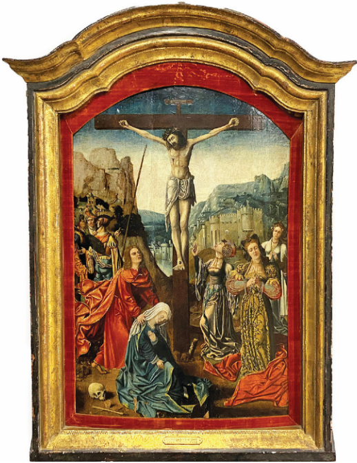
CONTINENTAL, 15TH C. OIL ON PANEL, 26.5 BY 16 IN.