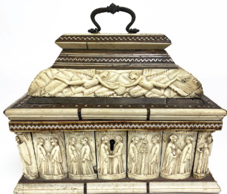
VENETIAN EMBRIACHI CARVED BONE WEDDING CASKET 15/6TH C. , ONE OF TWO, 7.5”H; 9.5”W,