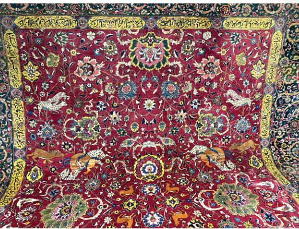
KASHAN ROOMSIZE HUNT CARPET (THE ONLY CARPET IN THE SALE) 9'7" FT. BY 12 FT. 8 IN.