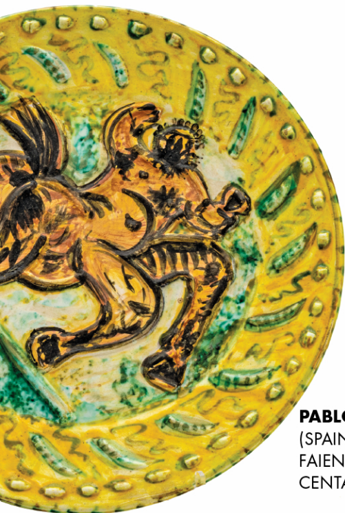
PABLO PICASSO (SPAIN, 1881-1978) TERRE DE FAIENCE PLATE, 1956, DIA 16.25", CENTAURE (A.R. 339)