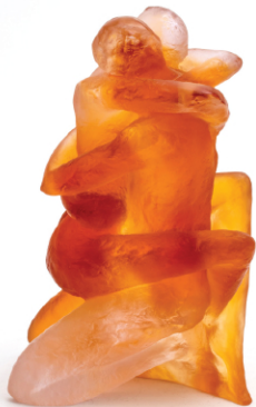
DAUM NANCY PATE DE VERRE GLASS SCULPTURE, H 10", W 4", LOVING COUPLE