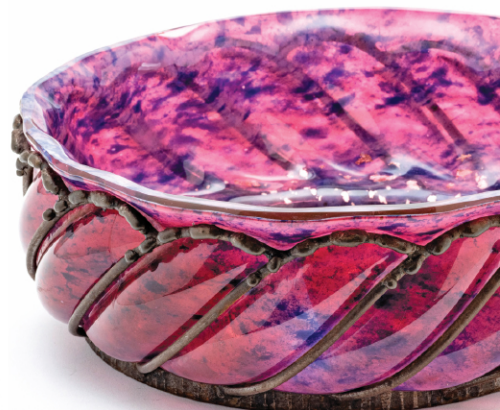
DAUM & LOUIS MAJORELLE ART GLASS & IRON BOWL, H 4.5", DIA 12.5"