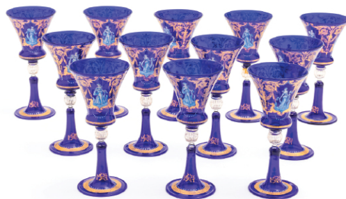
VENETIAN HAND BLOWN COBALT BLUE GOBLET, ENAMEL DECORATED, C 1910 12 PCS H 7.5"