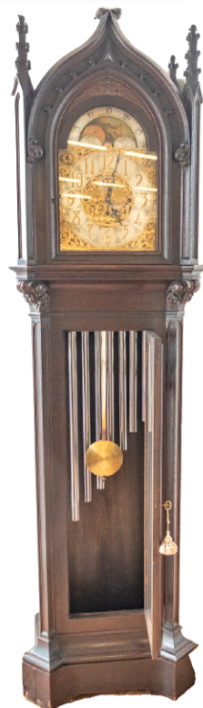
HERSHEDA GOTHIC STYLE CARVED OAK GRANDFATHER CLOCK, C. 1900, H 94", W 26", D 16"