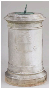
Large marble sundial 38-1/2"h, 23"dia.