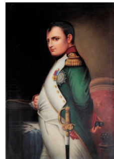
Napoleon porcelain plaque. 7"h, 5"w.