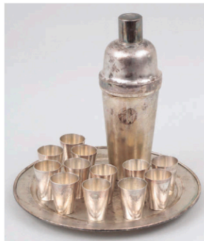
Chinese Export fourteen-piece silver cocktail set. 63.8 ozt.