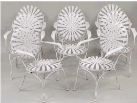
Set of (8) spring steel armchairs 34-3/4"h, 23"w, 24"d.