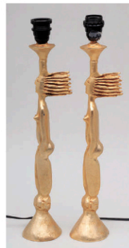
Pierre Casenove candlesticks. 19"h.