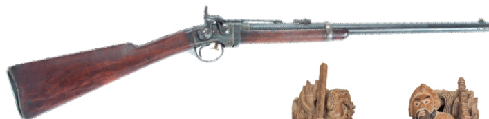
SMITH BREECH LOADING SINGLE SHOT PERCUSSION 0.50 CALIBER CARBINE WITH SADDLE BAR #231