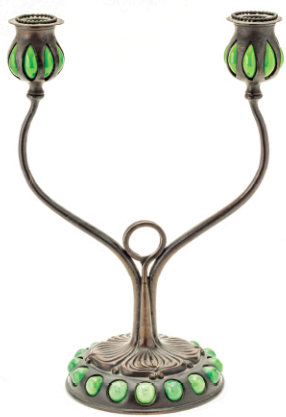
TIFFANY STUDIOS D886 BLOWN OUT DOUBLE CANDLESTICK BRONZE C. 1905-1915 H 12" W 9"