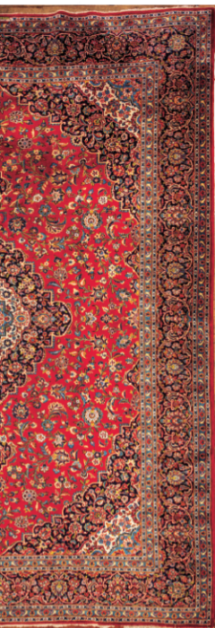
PERSIAN KESHAN ORIENTAL CARPET W 10' L 14'