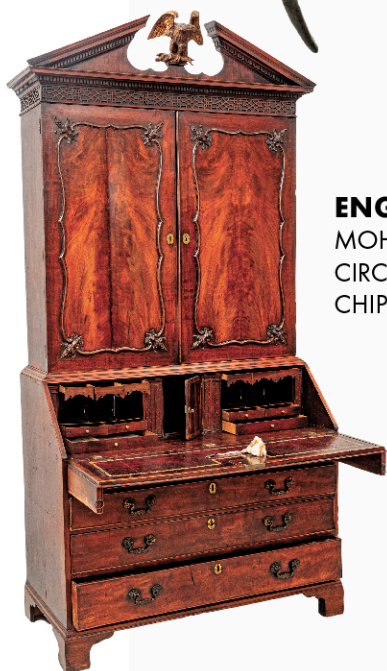
ENGLISH MOHAGANY BUREAU CIRCA 1760 CHIPPENDALE STYLE