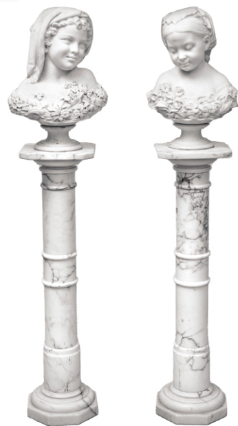
THOMAS BALL (AMERICAN 1819-1911) CARVED CARRARA MARBLE BUSTS WITH PEDESTALS, C. 1868 AND 1873, TWO, H 19.5", W 13", LA PETITE PENSÉE AND SUNSHINE