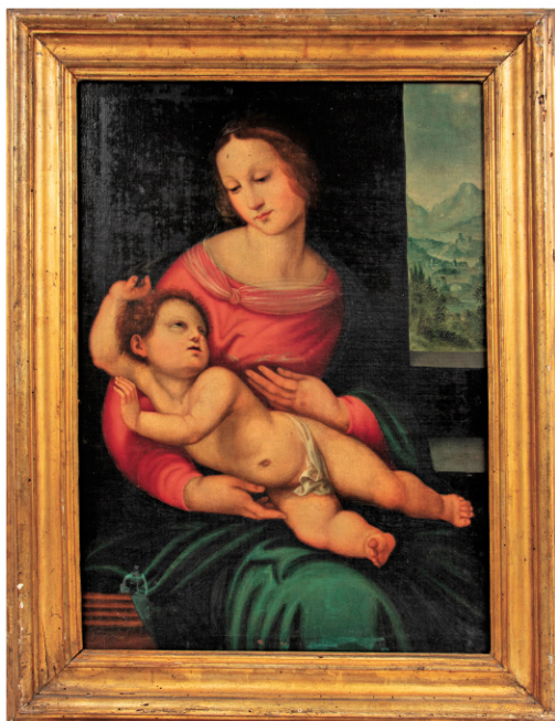
CIRCLE OF RAPHAEL (ITALIAN, 1483 - 1520) OIL ON CANVAS, 16TH/17TH CENTURY, H 32" W 22.25" MADONNA CON BAMBINO