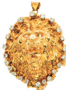
18 KT YELLOW GOLD & DIAMOND LION HEAD PENDANT H 2 1/4" W 2"