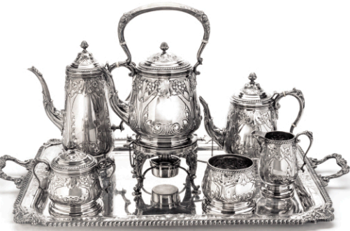
DURHAM (NEW YORK), STERLING SILVER COFFEE SERVICE, 7 PCS L 28" INCLUDING TRAY