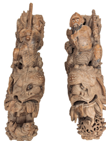
CHINESE CARVED SANDALWOOD BRACKETS, EMPEROR AND YOUNG PRINCE RIDING IMPERIAL LIONS EARLY 18TH C., PAIR H 37" W 10" D 19"