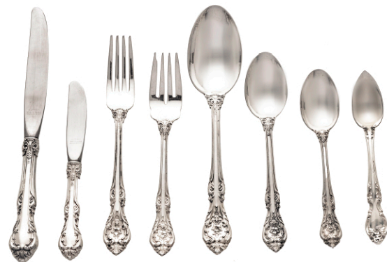
GORHAM "KING EDWARD" STERLING SILVER FLATWARE FOR 12, 99PCS