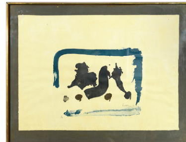
HELEN FRANKENTHALER (American, 1928-2011). "BROWN MOONS" 1961. Lithograph