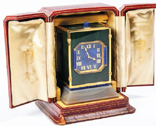
CARTIER 18K YELLOW GOLD, LAPIS LAZULI, ONYX, JADE, AND MOTHER-OF-PEARL DOUBLE-DIALED MANTEL CLOCK