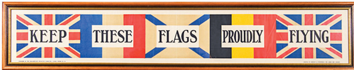
WORLD WAR I RECRUITMENT POSTER: KEEP THESE FLAGS PROUDLY FLYING