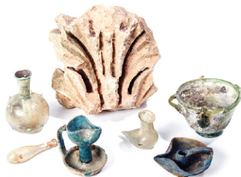
PART COLLECTION GRECO-ROMAN ANTIQUITIES