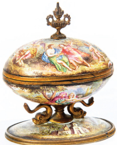
CONTINENTAL HAND-PAINTED ENAMELED PORCELAIN EGG-SHAPED BOX, mid 19th century

Saturday, April 9: 11 am – 4 pm • Monday, April 11: 10 am – 5 pm • Tuesday, April 12: 10 am – 5 pm Wednesday, April 13: 10 – 5 pm • Thursday, April 14: 10 am – 5 pm • Friday, April 15: 10 am – 5 pm Monday, April 18: 10 am – 5 pm • Tuesday, April 19: 10 am – 5 pm