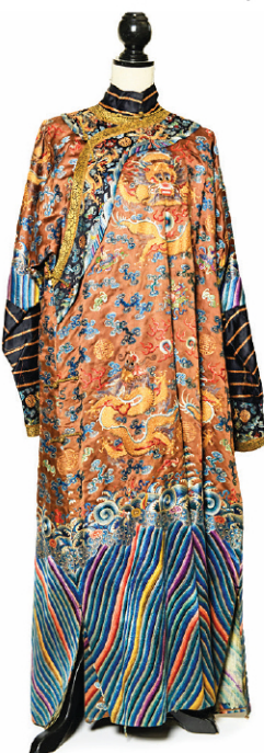
CHINESE IMPERIAL SILK EMBROIDERED ROBE