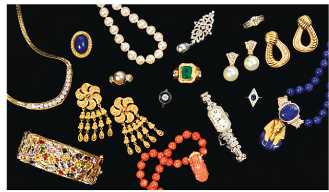
PART COLLECTION FINE ESTATE JEWELRY

Saturday, April 9: 11 am – 4 pm • Monday, April 11: 10 am – 5 pm Tuesday, April 12: 10 am – 5 pm • Wednesday, April 13: 10 – 11:30 am