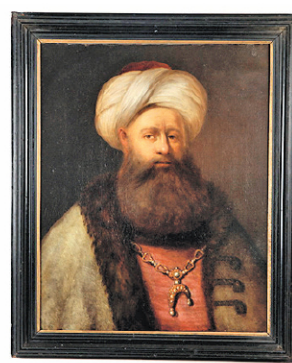
CONTINENTAL SCHOOL, (19th Century or earlier). Ottoman Empire Sultan