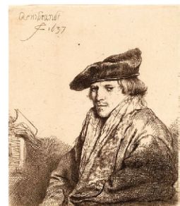
REMBRANDT VAN RIJN (Dutch, 1606-1669). Young Man in a Velvet Cap (Ferdinand Bol), 1637