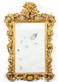
CONTINENTAL BAROQUE GOLD-LEAF MIRROR, 18th century