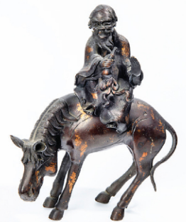
CHINESE BRONZE FENGSHUI LAO-TZU ON HORSE INCENSE BURNER, 19th Century or earlier