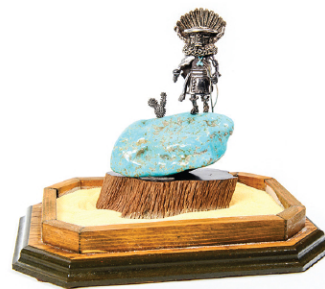
CAROL SUES (American, 20th Century). Eagle Dancer, Hototo Kachina, turquoise