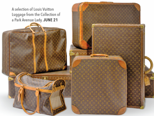
A selection of Louis Vuitton Luggage from the Collection of a Park Avenue Lady. JUNE 21