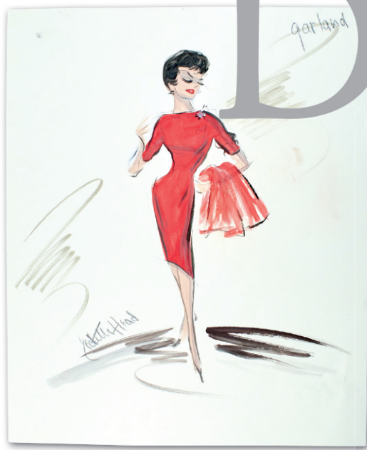
Edith Head , Original costume design for the red dress worn by Judy Garland in I Could Go On Singing , 1963, Watercolor and pencil, sheet 17 x 14. Est: $2,000-4,000. JUNE 24