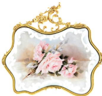
C.F. Monroe Plaques