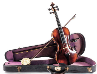
Selection of Violins