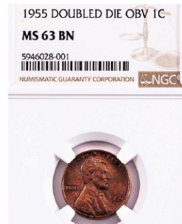
1955 DD Lincoln