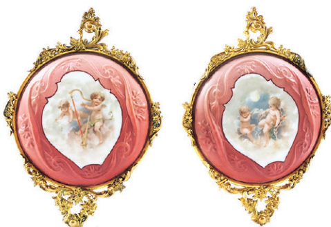
Lots of Wave Crest