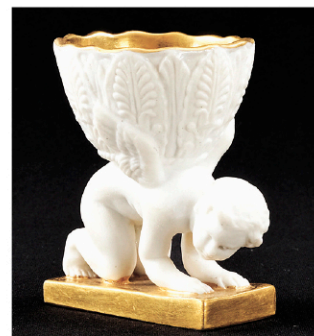
Open Salt Collection