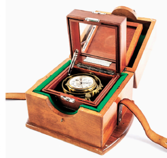
Hamilton No. 35