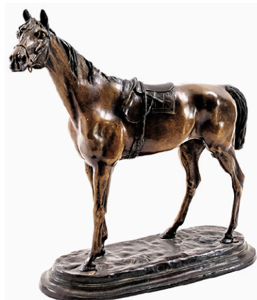
Selection of Bronzes