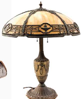
Selection of Panel Lamps