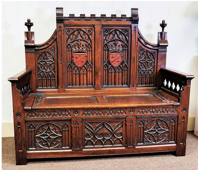
Gothic Hall Bench