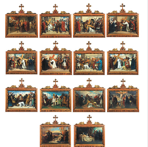
LOT 389 - A GROUP OF 14 PAINTINGS OF STATIONS OF THE CROSS, Passion of Christ, oil on tin, 21 3/8 x 33 1/8 in. Est.: $4,000-$6,000