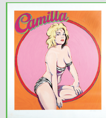
LOT 29 - MEL RAMOS [MELVIN JOHN RAMOS] (AMERICAN B. 1935-2018) Camilla, Printed by Clean Water, screen-print on paper, 36 3/4 x 32 1/8 in. [image], Est.: $1,500-$2,500