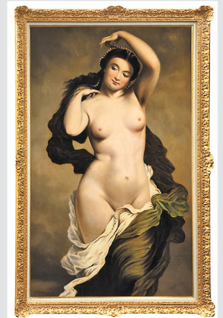
LOT 345 - CONTINENTAL SCHOOL (19TH CENTURY), Nude with Pearls, 1866, oil on canvas, 63 3/8 x 39 3/8 in. Est.: $2,000-$3,000