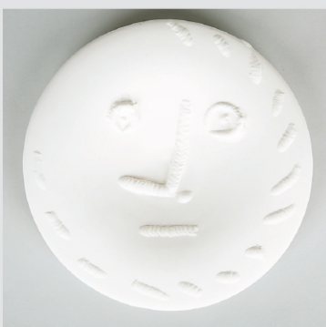
LOT 218 - PABLO PICASSO (SPANISH 1881-1973), Terre de faïence, conceived in 1963, white unglazed earthenware, diameter: 10 5/8 in. Est.: $3,000-$5,000