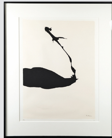
LOT 69 - ROBERT MOTHERWELL (AMERICAN 1915-1991), Africa 6 from Africa Suite, 1970, colored screen print, 31 1/8 x 23 3/8 in. Est.: $2,000-$3,000