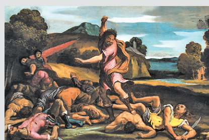
LOT 395 - CIRCLE OF AGOSTINO CARRACCI (ITALIAN 1557-1602), Samson and The Philistines, oil on panel, 16 3/8 x 25 1/4 in. Est.: $4,000-$5,000