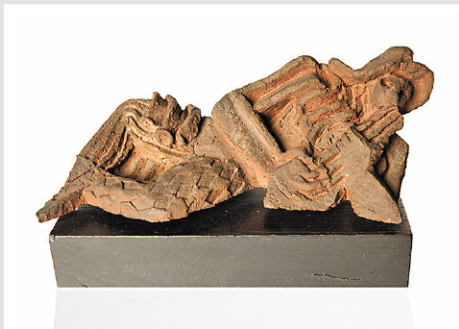
LOT 215 - OSSIP ZADKINE (RUSSIAN-FRENCH 1890-1967), Arlequin Couche, 1941, terracotta 5 7/8 (h) x 11 5/8 (w) x 4 3/4 in. (d) Est.: $15,000-$20,000