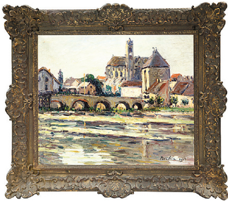
LOT 291 - FRANCIS PICABIA (FRENCH 1879-1953), Bridge at Moret-sur-Loing, 1902, oil on canvas, 18 1/4 x 21 5/8 in. Est.: $60,000-$80,000