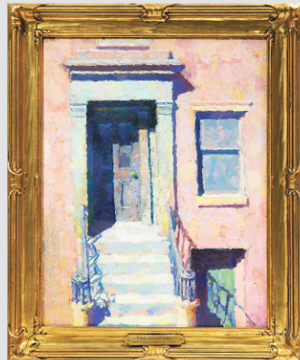
LOT 261 - JOHN P. RUSSELL (AUSTRALIAN 1858-1930), The Doorway, 1954, oil on cardboard, 16 x 12 in. Est.: $10,000-$15,000