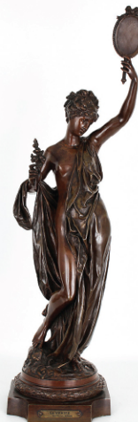
Albert-Ernest De Carrier-Belleuse (1824 - 1887) Bronze "La Verite". Height: 35.5 inches.