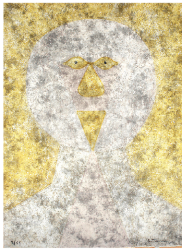
Rufino Tamayo (1899 - 1991) Pencil signed lithograph. 7/99. Size: 29.75 x 22 inches.