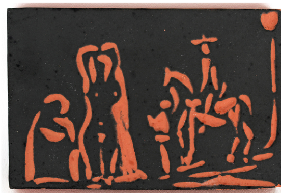
Picasso Madoura 'Personnages et cavalier' Plaque. (AR 540), 1968 Terracotta J149 Plaque. Numbered (362/500) verso. Size: 4.25 x 6.5 inches.