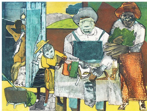
Romare Bearden (American, 1911 - 1988) "The Family" Color aquatint. Image size: 19 x 26 inches. Pencil signed and numbered 146/175 lower left.