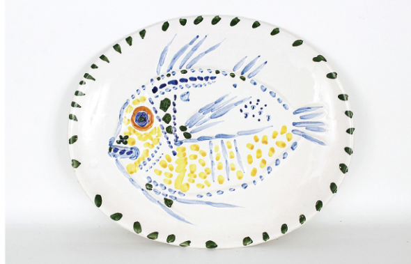
Pablo Picasso (Spanish, 1881-1973) Madoura, "White Ground Fish" (AR 168) Ceramic I114 Plate. Numbered (72/200) verso. Size: 13 3/8 x 16 6/8 inches.