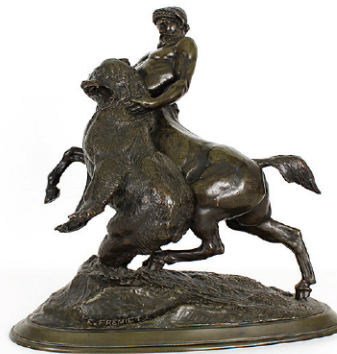
Emmanuel Fremiet (France, 1824 - 1910) Bronze Centaur Thereus Fighting a Bear. Height: 14.4 inches.