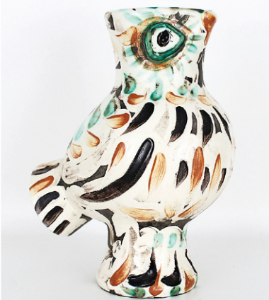
Picasso, Madoura 'Wood Owl' Ceramic Pitcher. 101/250. Height: 12 inches.