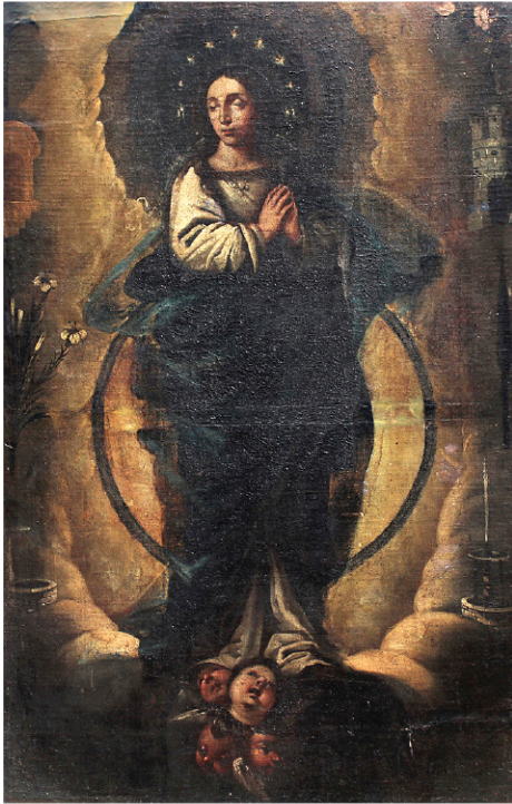
Monumental 17th C. Cuzco School Painting of the Virgin Mary. Oil on canvas. Size: 65 x 42.5 inches.

Over 400 lots of fine art, bronzes, glass, an important private collection of antiques, Chinese porcelain, original illustration paintings, jewelry and more.