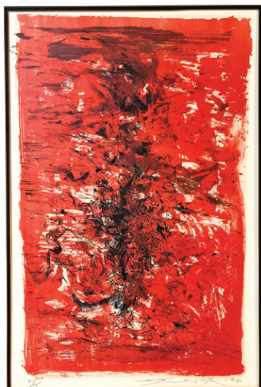
Wou-Ki Zao (China, 1921 - 2013) Pencil Signed lithograph. 42/125.

Over 400 lots of fine art, bronzes, glass, an important private collection of antiques, Chinese porcelain, original illustration paintings, jewelry and more.