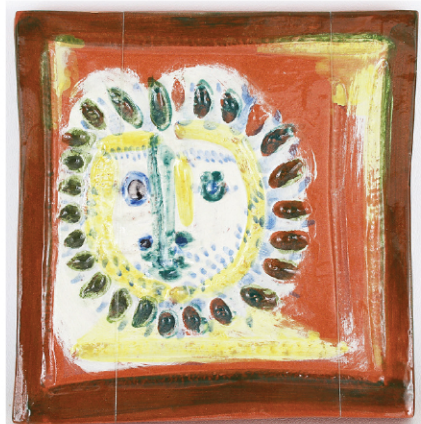
Picasso Madoura, Lion Ceramic Plaque 20/100. Dimensions: 6.5 x 6 3/8 inches.