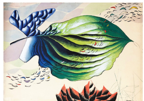
Herbert Bayer (Colorado California, Austria, 1900 - 1985) Surrealist Gouache painting. Signed and dated 1943 lower right.