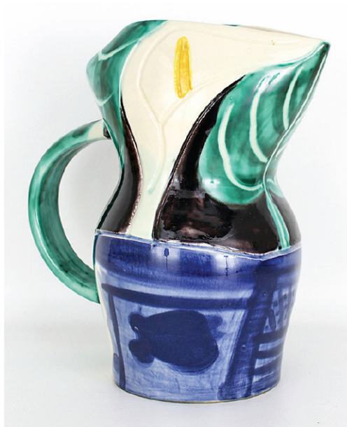
Pablo Picasso (Spanish, 1881-1973) Madoura 'Pichet aux arums' (AR 189), 1953 Ceramic Pitcher. Numbered (122/350) on base. Height: 12 inches.