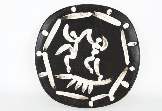
Pablo Picasso (Spanish, 1881-1973) Madoura "Two Dancers" (Deux danseurs) (AR 380). Diameter: 9.75 inches.