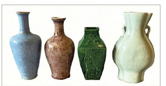
4 small Chinese vases