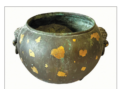
Gold splashed bronze pot