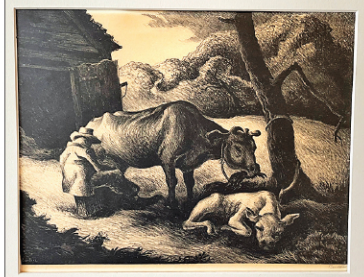
"White Calf" lithograph signed Benton