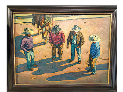
'Cowboy Conference" by Howard Post 2011 (30 x 39) oil on canvas