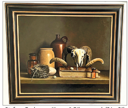
Stefaan Eyckmans "Angus" Oil on panel, (26 x 21)