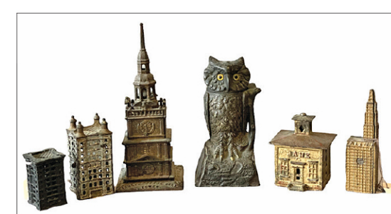
Lot of old iron banks including Stevens mechanical

including inlaid examples, antique Empire secretary desk, mahogany Wm and Mary 2 drawer country blanket chest, Victorian walnut 2 door bookcase, old 4 panel decorated Asian screen, antique one draw stand, oak bible stand with bible, unusual 6 pc white patio set with meshed metal round table, 4 chairs and settee, Virginia Craftsman Windsor writing chair, Mission Oak library desk, antique paint decorated dome top immigrants trunk, pr tall mahog corner cabinets, sm antique Regency style MT console table, mah weight driven tall clock, early cvd Continental chest (as found), 6 Empire chairs, antique country cupboard, antique stands, great Chadwick spool cabinet, Mid-Century "Wesnofa" leather chair and stool, lg decorative metal bird cage, French style inlaid game table, Globe Wernicke 3 section barrister bookcase with leaded glass, Teak wall display cabinet, French country decorated mirror, French MT corner table, Charles Webb style footstool, sm. 3 draw oak file cabinet, carved French table and more.