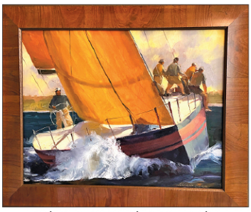
"The Baience" oil on canvas by Howard Carr (24 x 30)