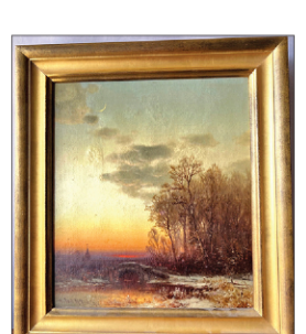
George Herbert McCord Twilight oil on canvas (14 x 12)