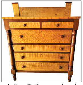
Antique Bird's eye maple and cherry Chest