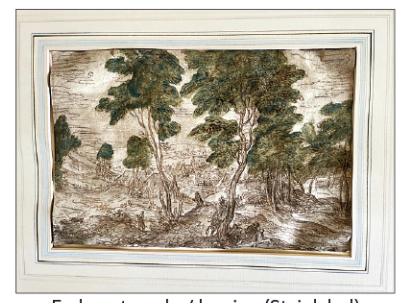
Early watercolor/drawing (Stair label)