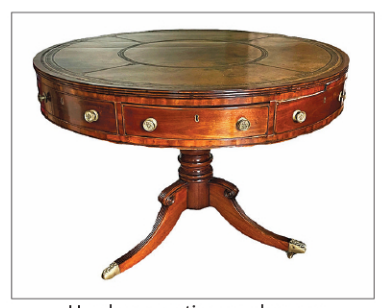
Handsome antique mahogany Regency style drum table (42")