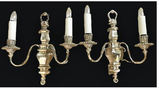
Silver plated bronze 2 arm sconces C. 1890