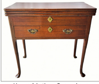
Unusual Antique Queen Anne Game Table with drawer