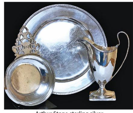
Arthur Stone sterling silver