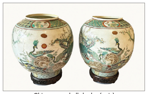
Chinese eggshell shades (as is)