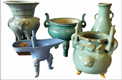
Group of Chinese footed censers, vase etc.