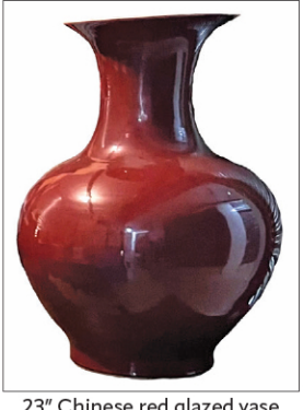
23" Chinese red glazed vase

FURNITURE: Handsome antique mahogany Regency style drum table with drawers (42"), antique mahogany Hepplewhite inlaid sideboard, pr of unusual antique teakwood 2 draw etageres, Asian teakwood carved altar table, unusual Japonesque bamboo/lacquer mirrored side cabinet, classical antique mahogany pier table, Centennial mahog inlaid sideboard, antique French walnut Server, set of 5 unusual carved English chairs, small French vitrine w. metal mounts, antique Asian caned corner chair, unusual antique English Queen Anne game table, large cherry and bird's eye maple chest w/ backsplash, antique classical center table, several small antique chests