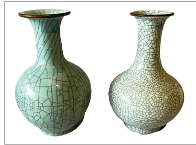
Two Chinese crackle glazed Celadon vases