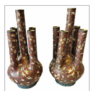
Pair of Champleve vases