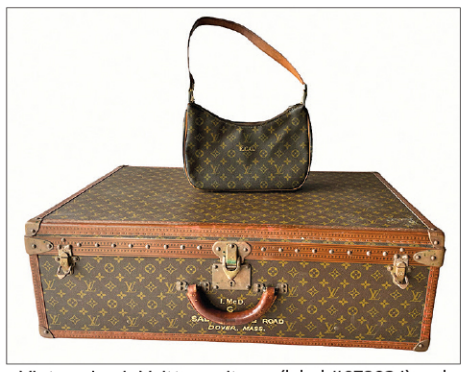
Vintage Louis Vuitton suitcase (label #878034) and Handbag