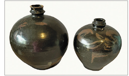
Chinese black glazed ovoid vessels