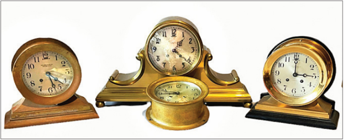
Collection of Chelsea ship's bell clocks

We are pleased to offer a Two Session Antique Estates Auction featuring fine quality selection of Antique American, English, French style furniture, fine porcelain and pottery, artwork, sterling, fine jewelry, lamps, bronzes and much more including collection of over 120 fine lots of interesting items including Chinese and other Asian porcelain and pottery, antiquities, silver, bronzes, Chelsea clocks, Asian furniture etc. collected by a New England gentleman over many years, in addition antique furnishings and art from a lovely Dedham home, as well as items drawn from Beverly Farms, Cambridge, two Sudbury homes and others with selected additions will be offered. Many fresh to the market offerings in both sessions. Items arriving daily. 350 + choice lots.