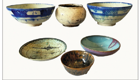
Group of Chinese rice bowls etc. with various markings