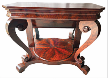
Late Classical mahogany mirrored pier table