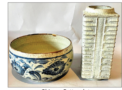
Chinese Pottery lot