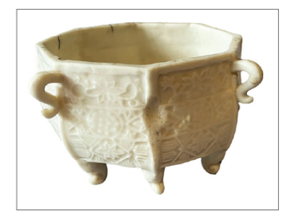
Chinese Footed bowl