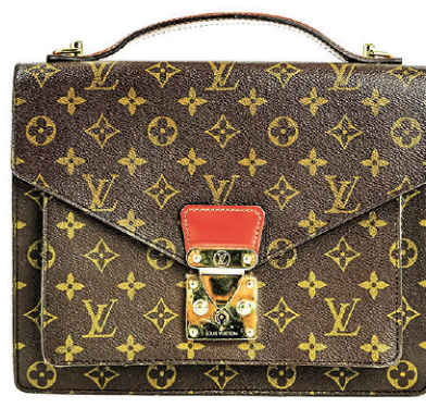
1 of 12 Louis Vuitton Vintage Bags