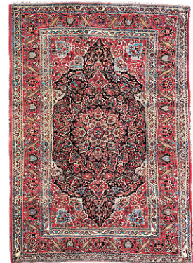
Lavar Kerman Main Carpet