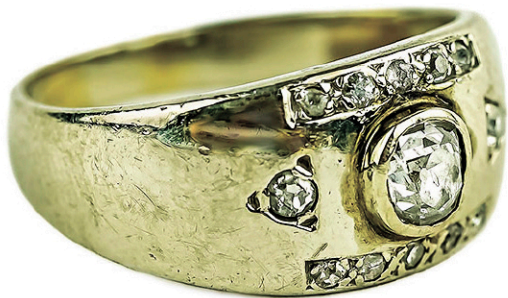
1 CT European RD Cut Ring