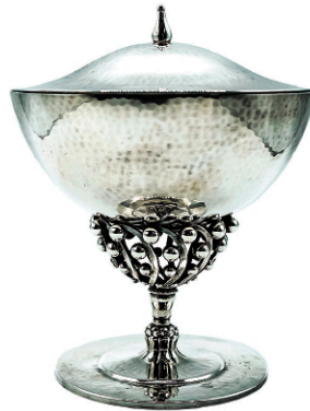
G Jensen Covered Tazza