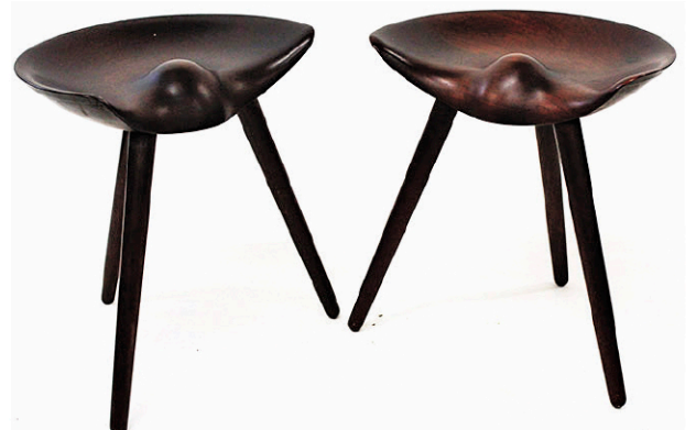
Pair of Mogens Lassen Stools