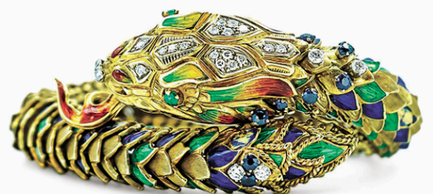
18k 146 Grams Diamonds Emeralds & Sapphires Italian Serpent Bracelet

Merrill's Auctioneers and Appraisers is pleased to offer Mid-Century and Modern Furniture, Art, and Accessories, including several very good Mid-Century Paintings from a NYC estate, part I of an extensive collection of African & Papua-New Guinea Ethnographic and Tribal art, Studio Pottery, Art Glass including several rare Venetian makers, vintage Designer clothing and accessories, rare Books from an English Literature Professor's estate, Silver, Jewelry, Accessories, Oriental Carpets, Prints and Lithos from other fine estates and homes.