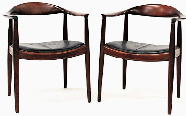
Pair of Hans Wegner for Hansen Chairs