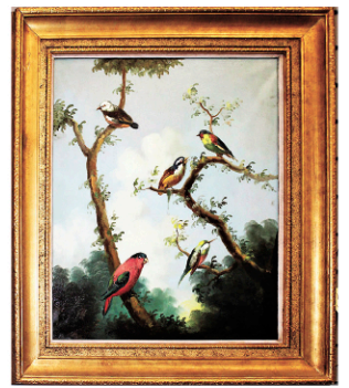
Ira Monte (SP 1918-) Birds of Paradise