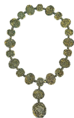
Cartier Sterling Jackie O Belt