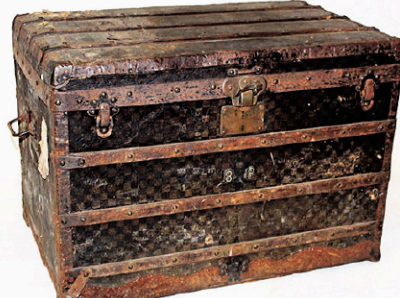
Louis Vuitton Trunk