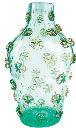
1 of 80 Plus Lots of Studio Art Glass & Pottery