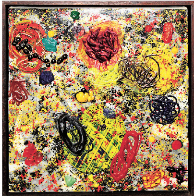
Frank Owen (American Contemporary) Mixed Media on Canvas