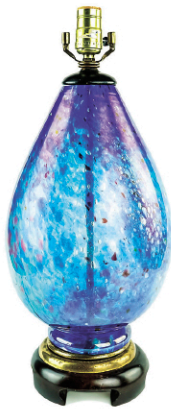
Erede Barovier "A Stella" Murano Lamp