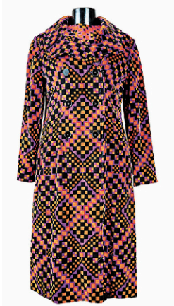
Oscar De La Renta 1960's Two Piece Outfit