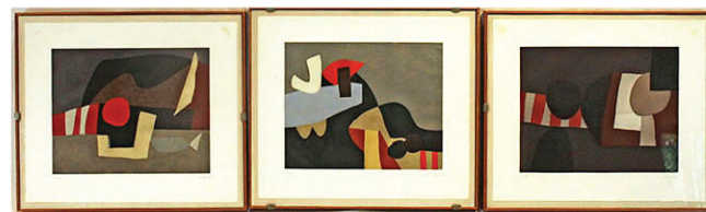
Several works of Mid-Century Modern art incl these 3 examples by Afro (1912-1976) signed & #d colored aquatints

Follow the link below to see our online catalog on Live Auctioneers where the full picture is unveiled!