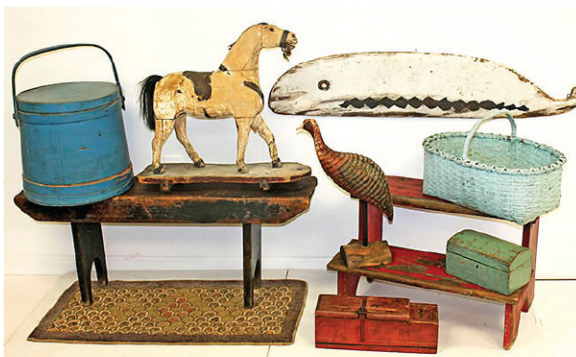
Showing a sampling of the Country primitive & folk art items