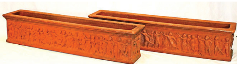
Wonderful pair of Italian carved terra cotta planters