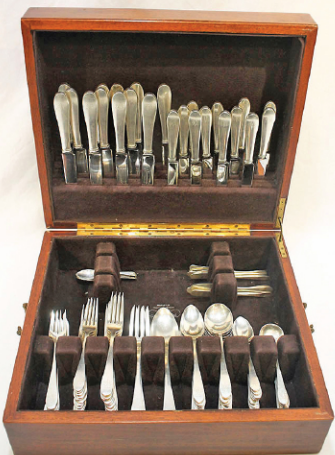
Tiffany & Co "Faneuil" sterling silver flatware service in fitted box – approx 127 pcs