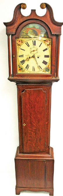
Several clocks incl this tall case example – face signed T.E. McFarlane – Leven – other clock examples incl mantle, ships, etc