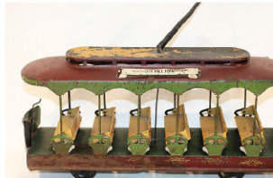
Lionel/Converse 2-7/8" Gauge #300 "City Park" Trolley ca. 1902