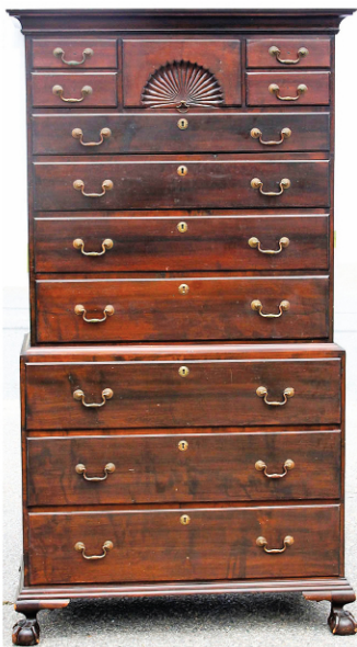
Period furniture incl this estate fresh 18thC maple chest on chest