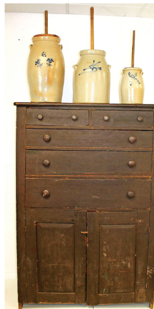
One of three country cupboards is this Mid-Western 5 drawer over 2 door example in Spanish Brown paint shown w 3 stoneware churns (just a sampling of the stoneware being offered!)