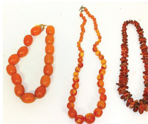
3 ca 1900-1920 wonderful large Baltic amber bead necklaces