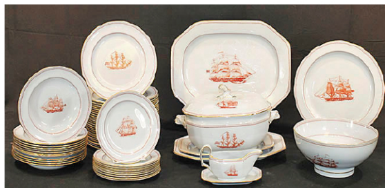
Many china sets incl this great Spode "Trade Winds Red" service for 12 w serving pieces