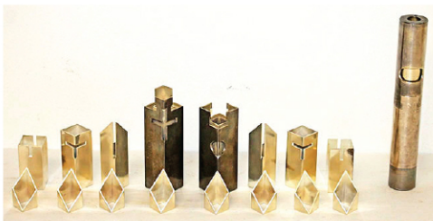
Very interesting Charles O. Perry stainless steel chess puzzle set