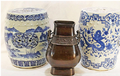
Asian items incl these blue & white porcelain garden seats shown w large bronze urn