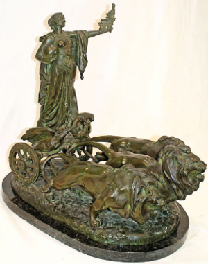
Fantastic French bronze of 2 lions pulling a chariot w Goddess rider on marble base