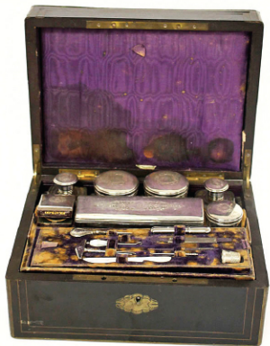
Antique travel grooming box w French silver lidded boxes & accessories orig sold by "Tiffany, Young & Ellis" (1841-1850's) which later became Tiffany & Co

https://flying-pig-auctions.liveauctioneers.com