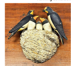
Early folk art carving with birds in nest, original paint, 7in.