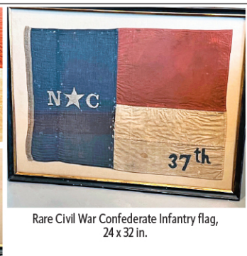
Rare Civil War Confederate Infantry flag, 24 x 32 in.