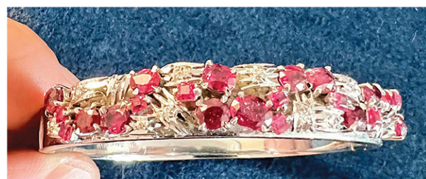
Natural rubies and diamond bracelet, 14k white gold