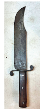
Rare handmade Bowie fighting knife, 18.5in. long