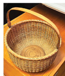
Early Nantucket basket, 10in.