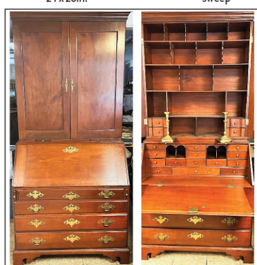
18th c. Conn. secretary desk