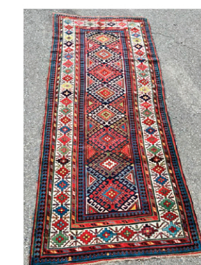
Caucasian runner 8'