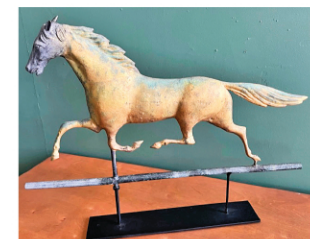
Running horse weathervane original surface 28in.