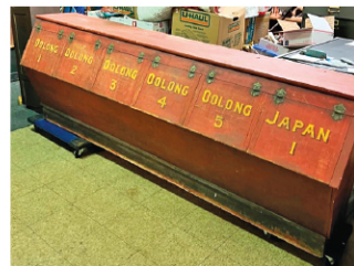
Rare wooden store tea bin, 3' x 8'