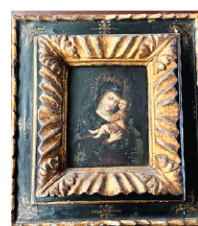
Phillipo Lippi (attrib.) oil on panel, 5.5 x 7.5 in.