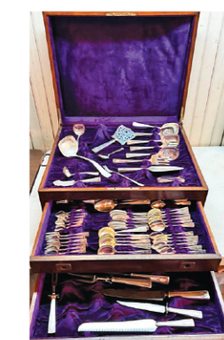
Sterling silver flatware set in original box, 98 Troy oz.