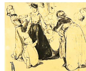
Rose Cecil O'Neill 1874-1944, original ink on paper, 14 x 18in.