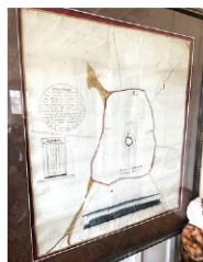
Rare hand painted map of Lime Island, Maine, 1835, 24 x 26in.