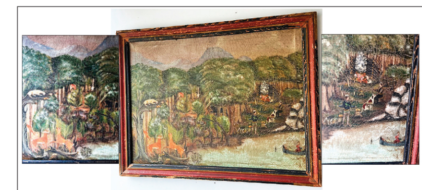
Folk Art oil 28 x 3 6in. (cracked)