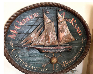
Coppersmith trade sign, 48in.