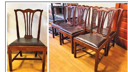
Period set of Chippendale side chairs