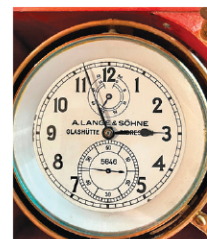
A. Lange & Sohne boxed chronometer. half second sweep