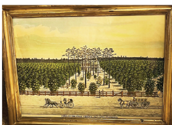
L.U. Dodge litho. Landscape View Co. Rochester, N.Y.