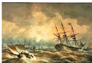
Watercolor by Nicholas Pocock 1740-1821, 20 x 30in.