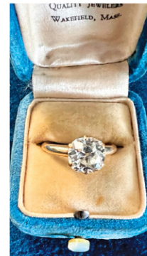
Solitaire diamond, 2.75 ct. Clarity SI2 Color H