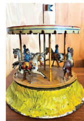
Fleischmann tin carousel, 6.5 x 6.5in. running condition