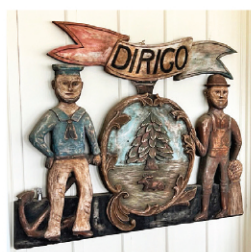
Folk Art carved Maine State Seal, 28 x 36in.