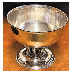
Georg Jensen sterling compote, 7.5in. dia.