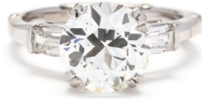
Platinum, White Gold, and Diamond Ring, round brilliant diamond 2.34 carats