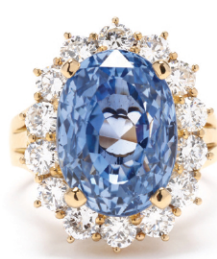
Gold, Sapphire, and Diamond Ring, diamonds weighing approx. 2 carats