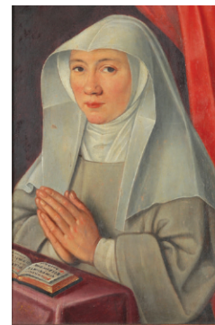
Franco-Flemish School (17th c.), Devotional Portrait of a Woman