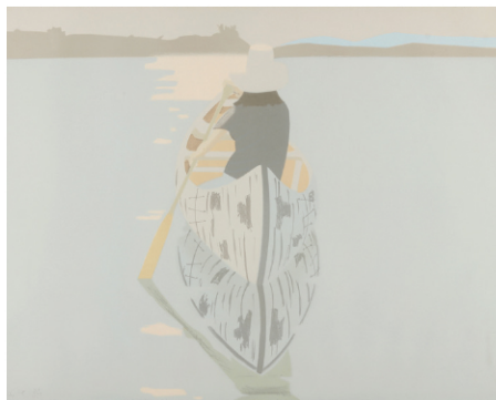
Alex Katz (Amer., b. 1927), Good Afternoon II (Gray Rowboat)