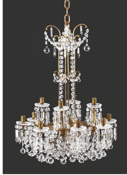
Signed Antique Baccarat Crystal Chandelier, France, late 19th century