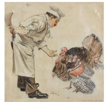
Frank Leyendecker (Amer., 1876-1924), Turkey Dinner

Leland Little The Signature Fall Auction Saturday, September 10