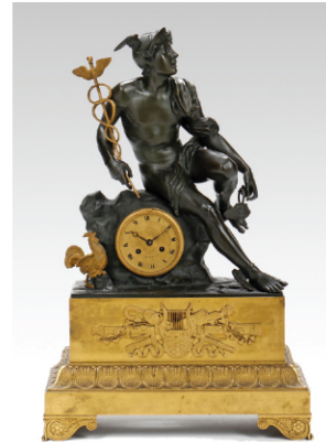
Tarault à Paris, Empire Period Gilt Bronze Mantel Clock