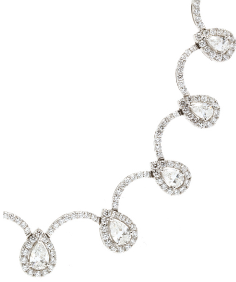
White Gold and Diamond Necklace, Luca, total diamond weight approx. 9.52 carats