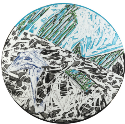
Frank Stella (Amer., b. 1936), Swan Engraving, Circle II, State I