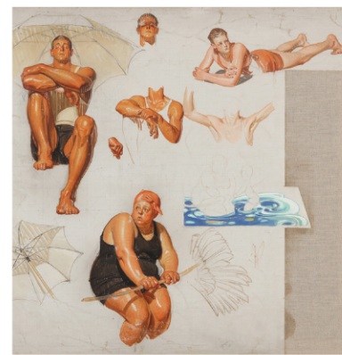
J.C. Leyendecker (Amer., 1874-1951), Study for King of the Beach