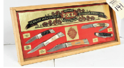
Lg. Selection of Schrade Knives incl. this IXL 1980 Set in Factory Display