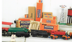
Huge 1950's Train Collection incl. Over 12 Cars & Many Accessories