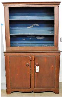
Country Furnishings & Accessories incl. this Early Stepback Cupboard