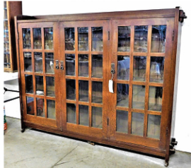
Quality Furnishings incl. this L.&J.G. Stickley 3 Dr. Bookcase