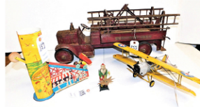
Exceptional Selection of Victorian & Vintage Toys