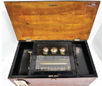
Super Swiss 10 Tune Cylinder Music Box w/3 Bell Strikers