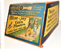
Great Graphic "Blue-jay Corn Plasters" Country Store Display