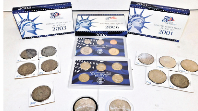
Will be sold in Single Pcs. & Group Lots incl. Early Silver Pcs., Sets of Mint Proof Coins & Paper money