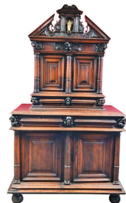
HENRI II RENAISSANCE WALNUT CABINET, 16TH C.