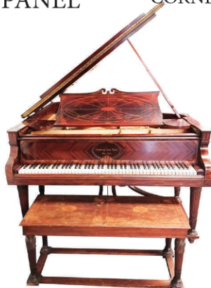
STEINWAY MODEL B GRAND PIANO W/ INLAID CASE