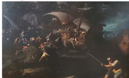
"BOLOGNESE SCHOOL", 17TH C. O/C