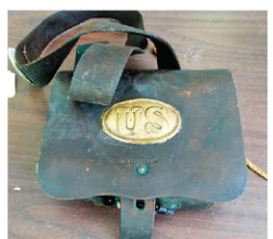
U.S. cartridge Civil War box