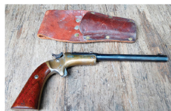
J. Stevens 1864 single shot pistol