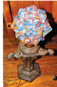
Deco figural lamp