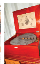
Regina music box with 39 records