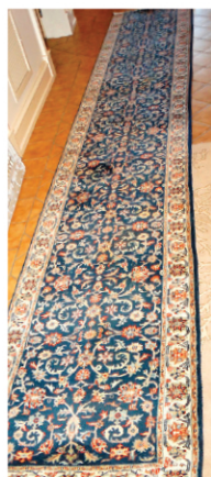
16' x 2 1/2' Oriental runner