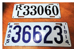
RI and MA porcelain license plates