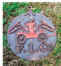
F.I.C. fire plaque