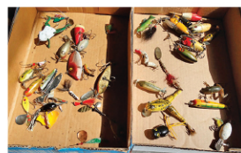
Many boxes of fishing plugs