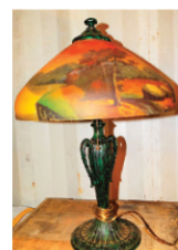
Possible Handel lamp

FURNITURE/CLOCKS/RUGS: child's Shaker rocker; Shaker sewing box; period low boy; period inlaid server; pr 19th century Windsor chairs; early candle stand; oval inlaid stand; multi drawer machinist chest; machinist toolbox; oak coffee table; oak cupboard; oval glass top table; 2-door bookcase; Mission Oak bookcase; marble top table; oak rocker; leather arm chair; library folding stairs; wicker table multi drawer cabinet; 2 Oriental runners; 5 Oriental rugs; 16'x2 1/2" Oriental runner