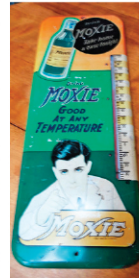
Moxie metal sign