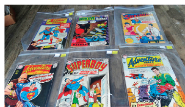
12 cent comics