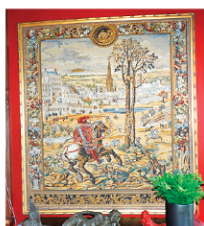
46" x 52" tapestry