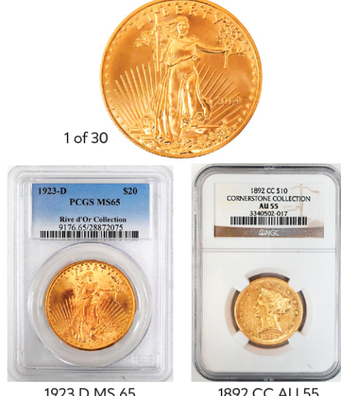
1923 D MS 65 Twenty Dollar