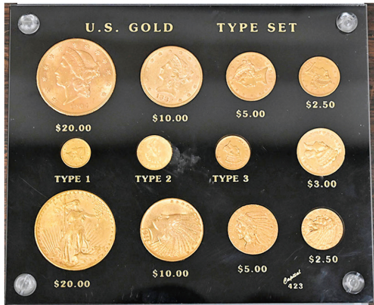
Gold Set 1

Stamps: Albums of stock certificates, large stamp