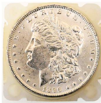
1 of Over 200