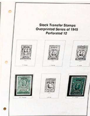
Part of Stamp Collection