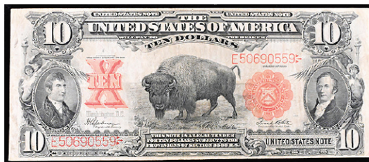
$10 Part of Collection