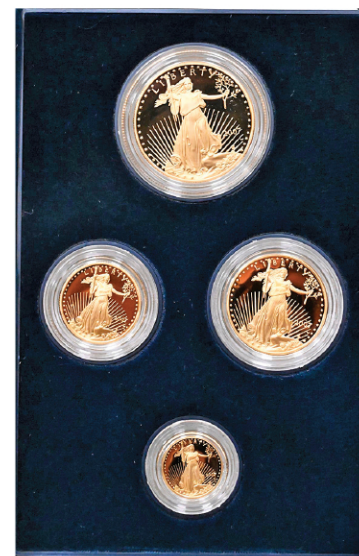
Gold Proof Set