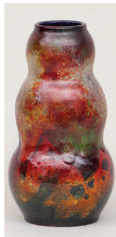
Chang ware vase 11-1/4”h.