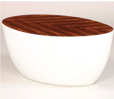
WENDELL CASTLE “Pod” table. 16-3/4”h, 34-1/2”w, 20”d.