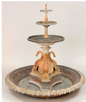
Large three-tier lead fountain 54”h, 57-1/2”dia.