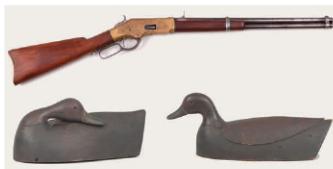
Winchester Model 1866; Townsend Carman black ducks.