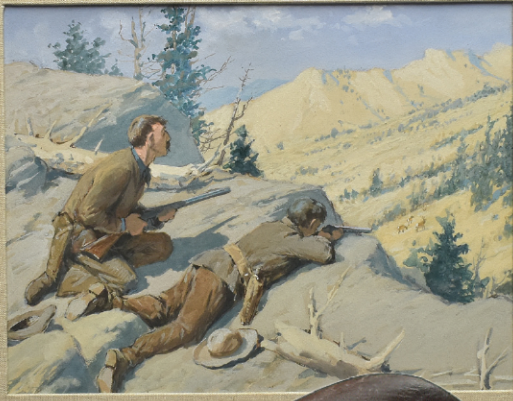
Arthur Burdett Frost. 10" x 13.25"