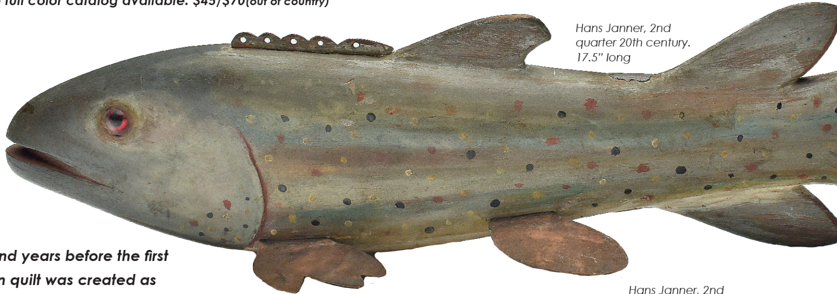
Hans Janner, 2nd quarter 20th century. 17.5" long

300+ page full color catalog available. $45/$70(out of country)