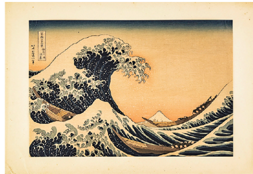
Hokusai (1760-1849) The Great Wave