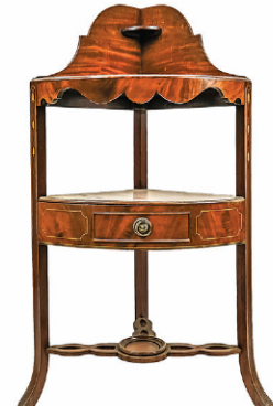
Hepplewhite Inlaid Corner Washstand - ex Israel Sack