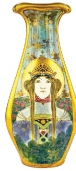
16" High Turn-Teplitz Amphora Vase