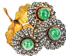
18k Buccellati Emerald & Diamond Brooch