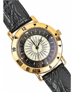
Waldan 18k World Time Wristwatch