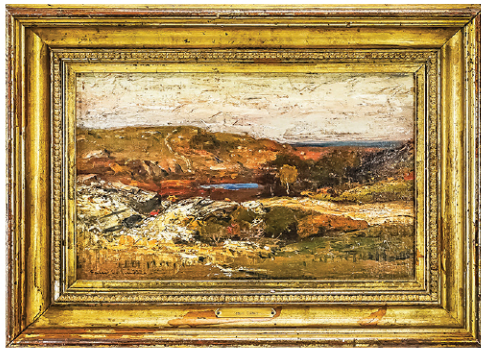
O/C Samuel Coleman (Am. 1832-1920) Rocky Farm Newport, RI