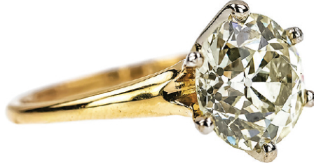
3.2 ct Diamond Solitaire Ring