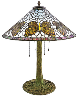
Riviere Studios Butterfly Lamp