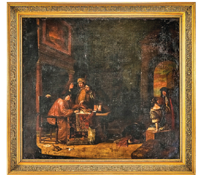
O/C 17th c Flemish School The Money Lenders