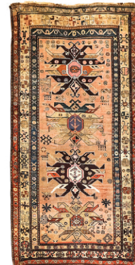
Eagle Kazak Dated 1901