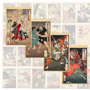
Yoshitoshi's Courageous Warriors near complete set