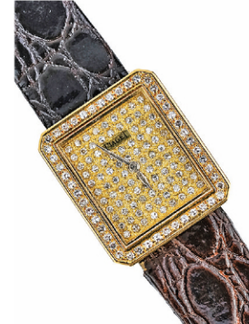
Piguet Diamond Pave Lady's Wristwatch