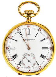
Patek Philippe 18k Chronometer Gondolo

137 JAMES BROWN DRIVE, WILLISTON, VERMONT