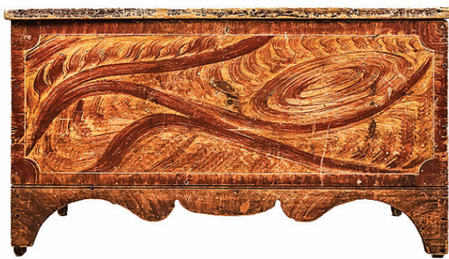
Early 19th c Brandon, VT Paint Decorated Box