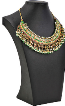
Mughul Empire Diamond, Ruby, & Pearl Collar Necklace