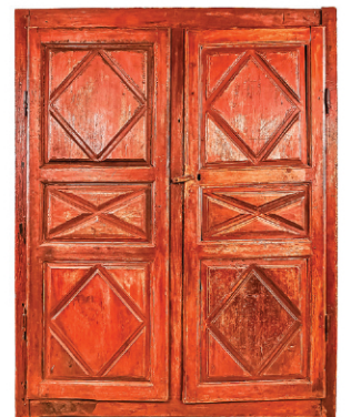
18th c Quebec Diamond Point Armoire