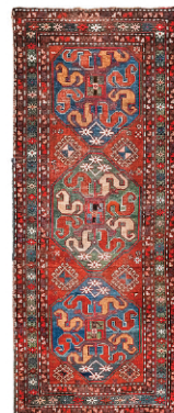
19th c Cloud Band Kazak