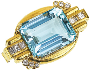
33 ct Aquamarine Brooch