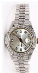
Ladies 18K Diamond Rolex