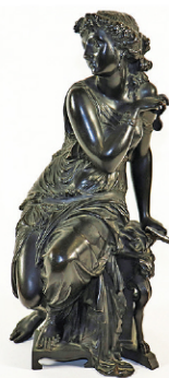
Tiffany & Co Auguste Peiffer Bronze