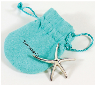
Tiffany & Co Peretti Brooch