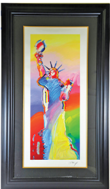
Peter Max Liberty Serigraph