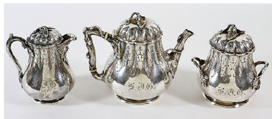
Tiffany & Co. 19th Century Tea Set