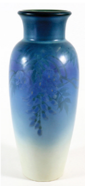
Rookwood Vellum Vase