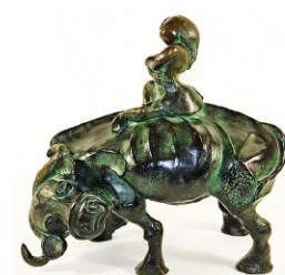
Graciela Rodo Boulanger Bronze