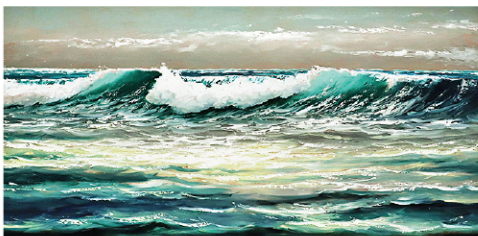
Harold Newton Highwaymen Painting