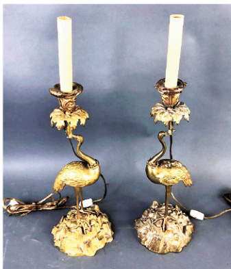
Pair Of Regency Gilt Bronze Crane Candle Sticks In the manor of Thomas Abbot 19 1/2" h