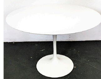
Knoll Saarinen Table v 28 3/4" h x 42" w