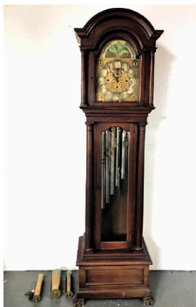
Tall Case Mahogany Clock, Early 20th Century With Westminster and Whittington Chimes 90 1/4" h x 26 1/2" w x 18 1/2" d