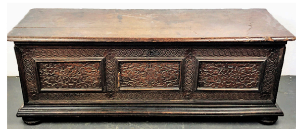
17th Century Italian Cassone. 24 1/2" h x 67" w x 21 3/4" d