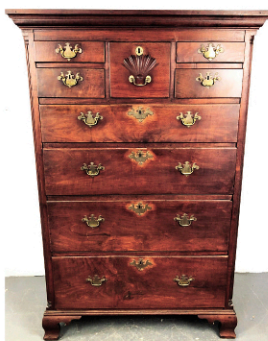
18th C. Mahogany Tall Chest. 67" h x 43 1/4" w x 23 1/2" d