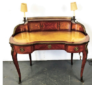
Louis XV Style Ladies Writing Desk with tooled leather top and bronze mounts. Height to gallery is 36 1/4" x 45 1/2" w x 25 1/2" d