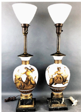
Pair of Tommi Parzinger Hand Painted Lamps. With bronze and marble bases, depicting females riding a bull and a lion. 35 1/2" h x 8" diam.