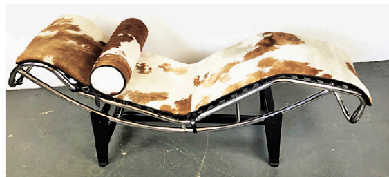
Le Corbusier Chaise Lounge LC4. With cow hide. 23" h x 70" w x 22 1/2" d