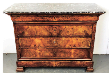
Commode Louis Phillipe Walnut Marble Top Commode. 38 1/4" h x 51 1/4" w x 22 1/2" d