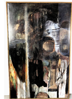
Fraser Leonard Abstract oil on canvas signed (lr) Overall 78 1/2" h x 50" w