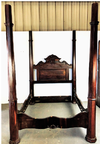
Charles Lee 19th C Rosewood 4 Poster Bed. 102" h x 68" w x 83" d