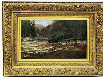
Alexander Wyant, o/c 15" x 24"