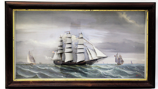
Shadow box, 40"