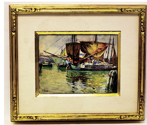
w/c M. Woodward, w/c 9' x 12'