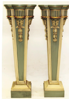
Painted wood, H: 4 ft.