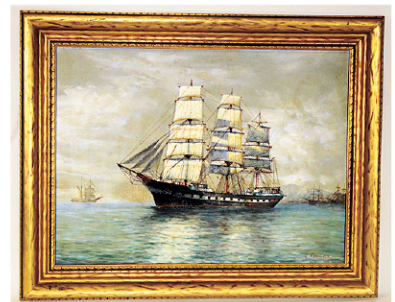
o/c 14" x 20", L. Papaluca