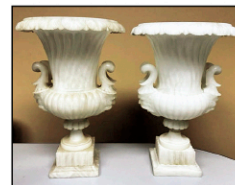
20" Alabaster urns w/ faces on handles