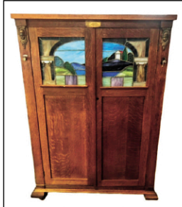
J.P. Seeburg oak Nickelodeon with leaded doors and rolls