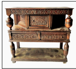
Jacobean carved oak antique Jacobean style court cupboard