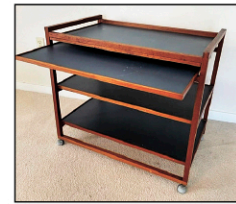
MCM bar cart