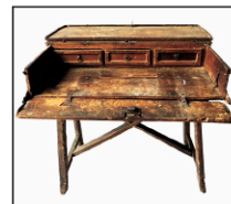
Unusual antique Italian style desk