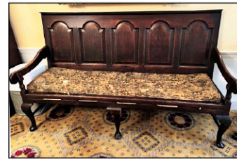
Highback early welch paneled back settee