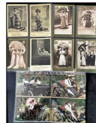
Album #625 Approx. 388 cards including Merry Widow hats, caricatures, etc.