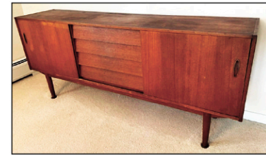
MCM sideboard "Dux"