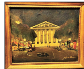
o/c Place de la Madeleine, artist signed 12 ½ x 16