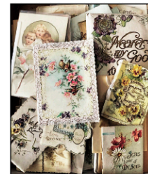
Lot #663 Religious and verse booklets.