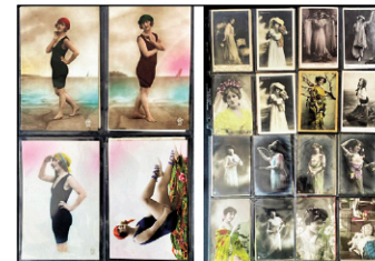
Album #618 Approximately 185 pieces with actresses, beautiful women, novelty cards etc. by various publishers.