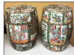
Pair of antique Rose Medallion garden seats