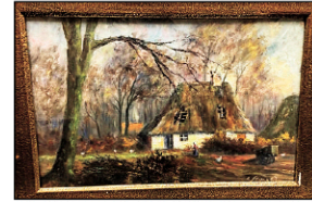
Pair of oil on board countryside paintings signed G. Stimart 14 x 12