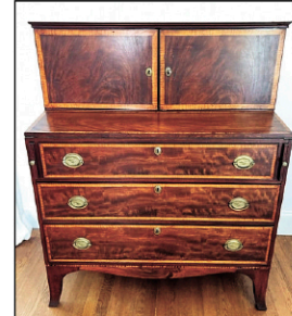
Antique banded inlay secretary