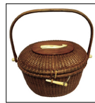
W.R. Sayle '75 Nantucket basket purse with whale carving