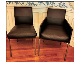
6 Modern MCM style dining chairs (KFF Karl Friedrich Forster)