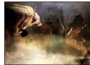
Dereck Harris o/c "Suspension of Dazzlement & Disbelief" 1994 41x56