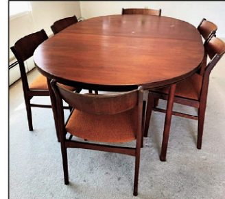
MCM Dining Set