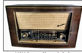
MCM German Blaupunkt Radio