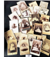
Lot #647 19thC Cabinet cards of Children and babies - Approx. 90 pieces plus 3 other very large lots of CDV & Cabinet cards (Lots 646, 648, and 649 totaling 350 pieces)