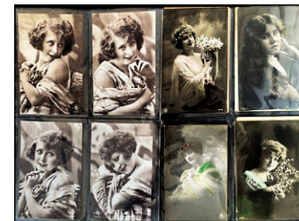
Album #612 Approximately 380 collection of unnumbered series or similar by publisher.