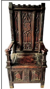
Carved antique Gothic furniture