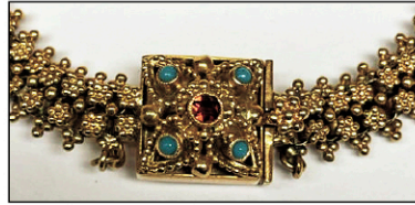
Fine gold jewelry