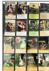
2 Album lot #622 with approx. 460 Bamforth and Co. Color postcards arranged in alphabetical order. One of his personal favorite lots.