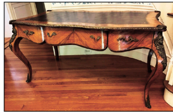
French style leather top desk with figural ormolu mounts