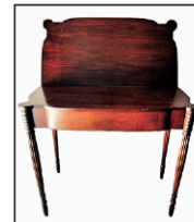
Antique Sheraton mahogany card table