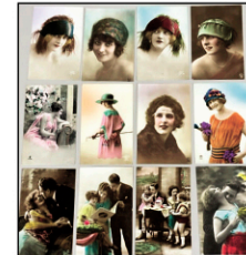
Album #601 Approx. 125 "ultra" beautiful woman and more as the collector called the album. French tinted examples etc.