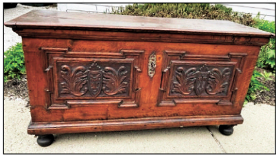
Early Italian carved cassone chest