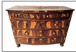
18th C Bowfront chest with exotic inlay on bun feet