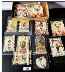
Lot #660 "Lacy" Valentine & other greeting cards etc.