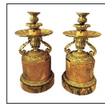
Gilt bronze candlesticks with marble