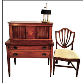
Beacon Hill estate furnishings