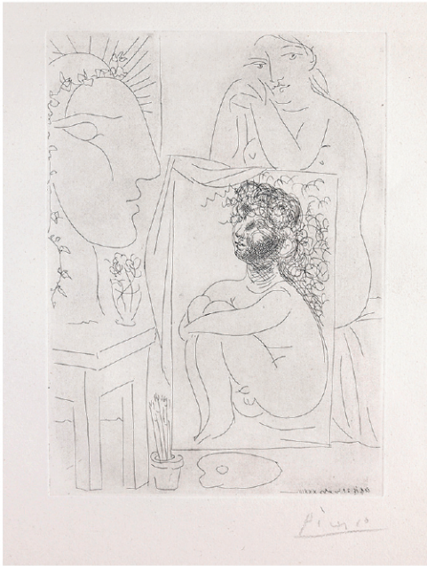
Picasso "Modele, tableau et sculpture" Etching. Image size: 10.25 x 7.25 inches.

Featuring over 300 lots of fine art, antiques, sculpture, prints and multiples and more.