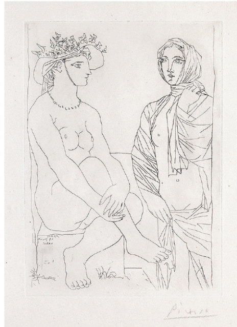
Picasso "Femme Assise au Chapeau et Debout Drapee" Etching. Image size: 10.25 x 7.25 inches.