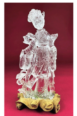
Chinese Rock Crystal