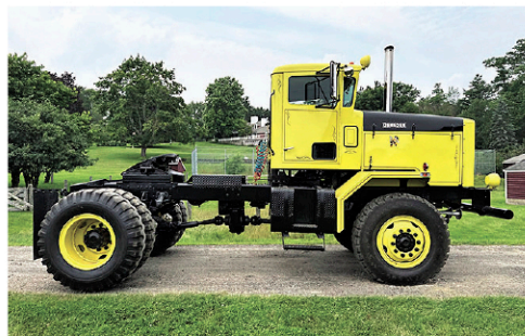
1965 Oshkosh WT-2206