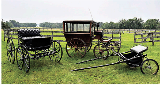
Horse Drawn Carriages and Sleighs