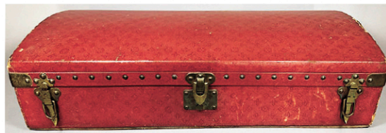
Rare Louis Vuitton Red Cabin Trunk