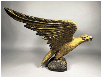
Pilot House Eagle Attributed to Bellamy