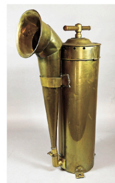
Large Selection of Nautical Items

Auction Subject to all Terms of Sale © 2023 Paul McInnis LLC • Lic. #2089 • (603) 964-1301 • Ref. #23PM-24