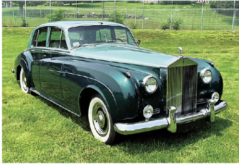
1957 Rolls Royce