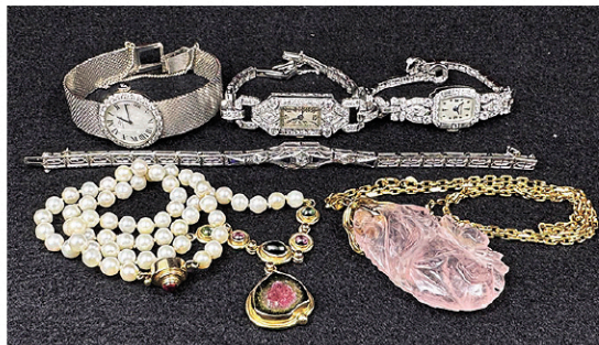
Selection of Jewelry