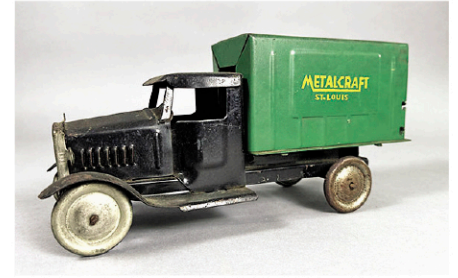
Collection of Pressed Steel Toys