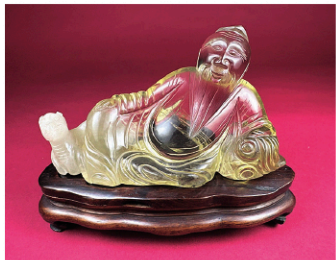
Carved Chinese Figure