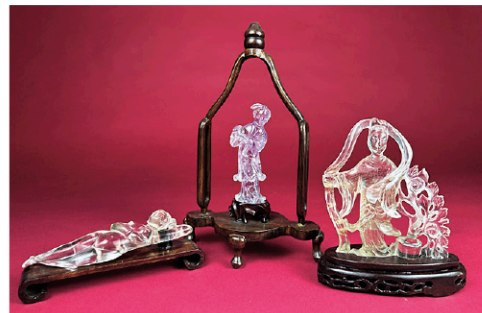
Chinese Rock Crystal