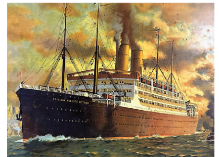
Tin Lithograph Cruise Line Advertisement