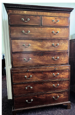
English Chippendale Chest on Chest