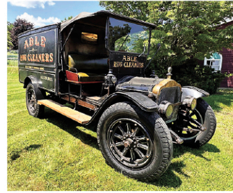
1916 White B20 Truck