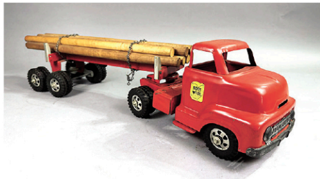
Collection of Pressed Steel Toys