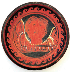
Greek Apulian Red-Figure Footed Plate with Winged Figure. Circa 350-300 BC

EXHIBITION: Saturday, September 9: 11am – 4pm • Monday, September 11: 10am – 5pm Tuesday, September 12: 10am – 5pm • Wednesday, September 13: 10am – 3pm