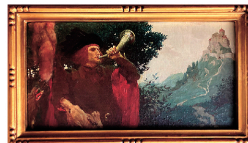
Howard Pyle (American, 1853-1911). Trumpeter Near Castle