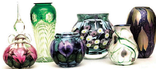
Part Collection Modern Art Glass Including Works by Charles Lotton