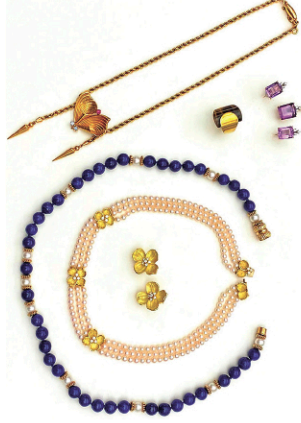
Part Collection Estate Jewelry

EXHIBITION: Tuesday, September 5: 10am – 5pm Wednesday, September 6: 10am – 5pm Thursday, September 7: 10 – 10:30am