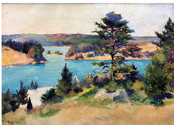
Frank Weston Benson (American, 1862-1951). Landscape