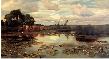
W. Sidney Cooper (1889). Landscape with cows and stream with lily pads