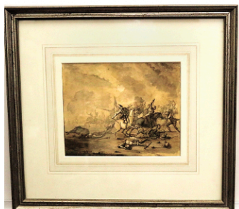
French School (Late 18th / early 19th century). Combat of Cavalry