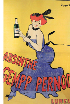
Leonetto Cappiello (Italian/French, 1875-1942). Absinthe Gempp Pernod - Lunel Poster