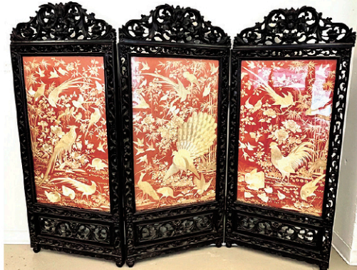
Chinese Three-Fold Floor Screen With Stitchwork Panels Depicting Mythical Birds Amidst Flowering Branches, circa 1880