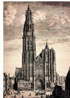
Wenceslaus Hollar (Bohemian, 1625-1677). Antwerp Cathedral