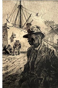
Martin Lewis (American, 1881-1962). The Roustabout, 1916