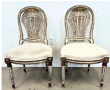
Two from Set Six Painted Italian Sidechairs with Balloon Motifs