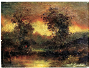
Attributed To Ralph Albert Blakelock (American, 1847 - 1919). Late Afternoon Landscape