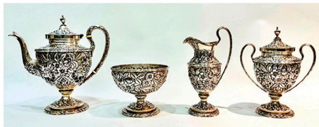
Four-Piece S. Kirk & Son Sterling Silver Floral Repousse Tea Service. Design no. 383