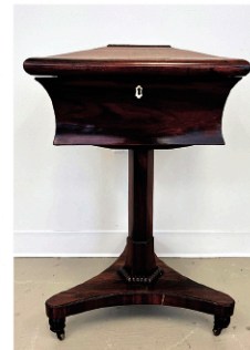
Georgian Rosewood Tea Poy

SLOANS & KENYON Auctioneers and Appraisers