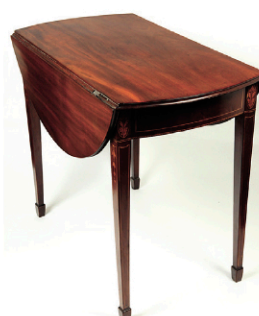
Baltimore Federal Inlaid Mahogany Bow-Front Drop-Leaf Table