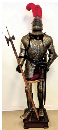
Full Size Reproduction Suit of Armour after a Model Worn By Charles V of Spain, mid 20th century. Spain.