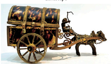
Tortoiseshell Perfume Box in the Form of a Horse-Drawn Wagon