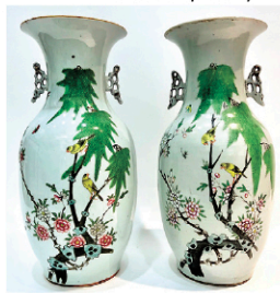
Pair Chinese Painted Porcelain Baluster Form Vases with Pierced Handles and Bird-in-Flowering Branch