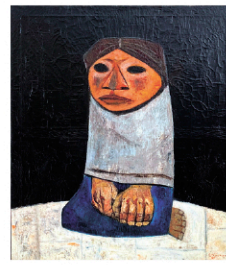
Eduardo Kingman (Ecuadorian, 1913 - 1997). Seated Girl, 1965