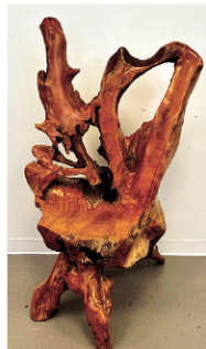
Rustic Teak Root Chair Sculpture