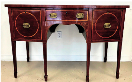
Georgian Hepplewhite Style Inlaid Mahogany Side Board