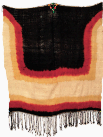
Ida Ou Nadif Heas Scarf, Morocco, Early 20th C.