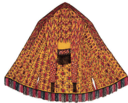
Tekke Turkmen Women's Chirpi, 19th C.