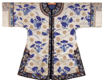
Han Chinese Woman's Surcoat, 19th C.