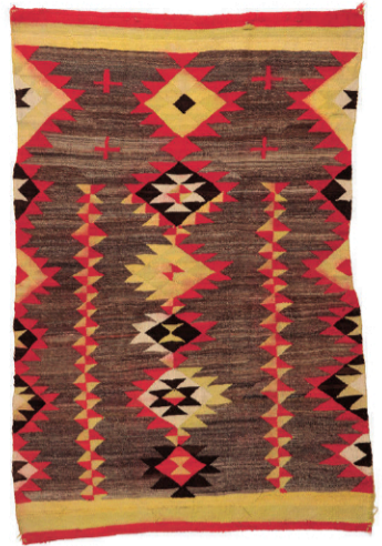
Native American Indian Navajo Transitional Blanket, C. 1880's