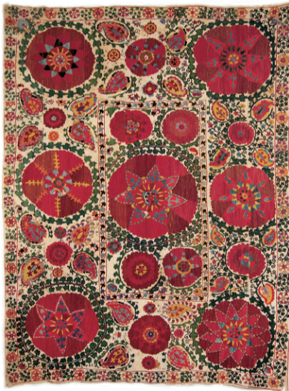
Bukhara Suzani, Uzbekistan, 19th C.