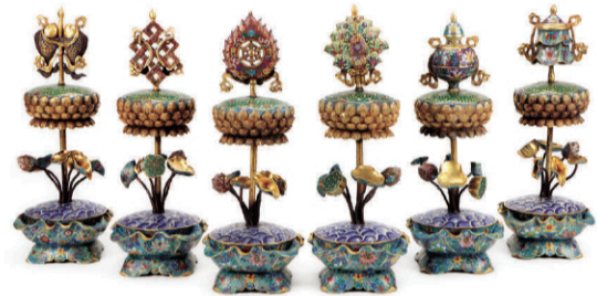
6 Sino-Tibetan Buddhist Gilt Bronze and Cloisonne Ashtamangalas Altarpieces