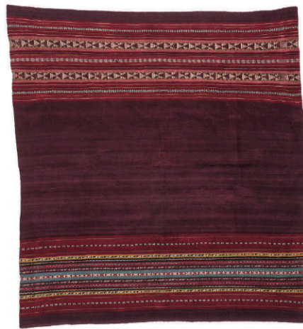
Aymara Aksu Bolivar, Mid 19th C.