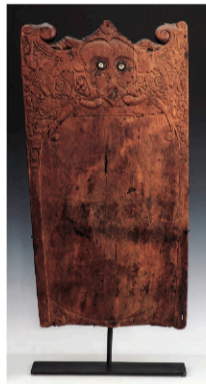
Antique Dayak Women's Work Board, Borneo