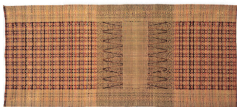
Malaysian Silk and Gold Songket, Late 19th C.