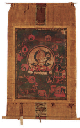
Early Antique Tibetan Thangka, Pre 1800