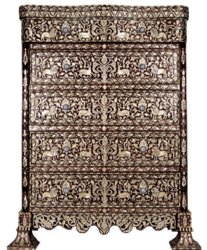
Inlaid Five-Drawer Chest, Syria, Mid 20th C.