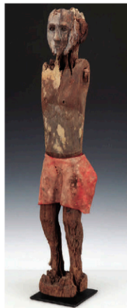
Antique Dayak Guardian Figure Hampatong, Borneo