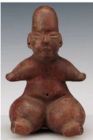
Pre-Columbian Pottery Olmec Baby Figure