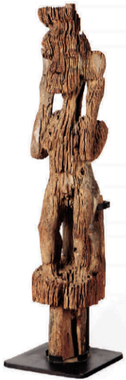
Large Antique Dayak Hampatong, Borneo

Live Showroom Auction: Thursday, September 28, 2023, 10 AM ET | Public Exhibition: September 25-26-27, 11AM – 4PM