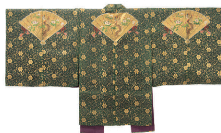
Noh Choken Theatrical Kimono, Japan, 18th C.