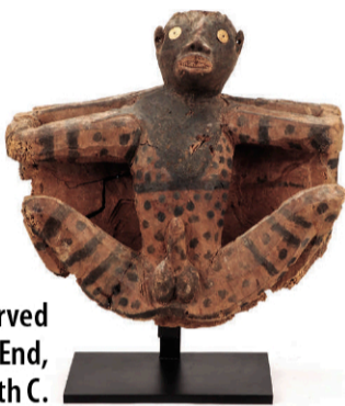
Dayak Carved Wood Coffin End, Borneo, 19th C.