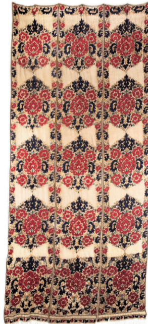
Three-Panel Curtain, Algeria, Late 18th C.