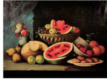
AMERICAN SCHOOL PRIMITIVE STILL LIFE $1,000-2,000