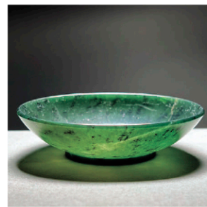
CHINESE SPINACH JADE BOWL $300-500