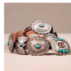
TURQUOISE & STERLING CONCH BELT | $500-700