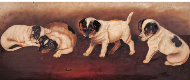
AMERICAN SCHOOL (19TH/20TH CENTURY) $500-700