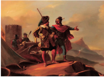
SPANISH SCHOOL (18TH/19TH CENTURY) $500-1,000