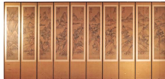
EARLY KOREAN 10 PANEL SCREEN $1,000-2,000