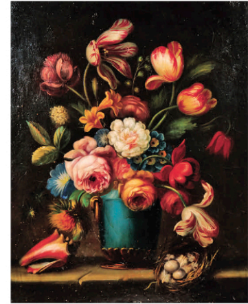
DUTCH/FLEMISH SCHOOL (18TH/19TH CENTURY) $800-1,200