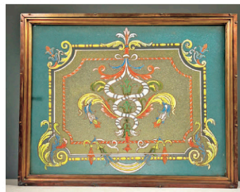
RARE H. GUIMARD ENAMELED GLASS WINDOW $1,000-2,000