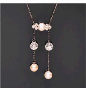
JE CALDWELL NATURAL PEARL & DIAMOND NECKLACE $8,000-12,000