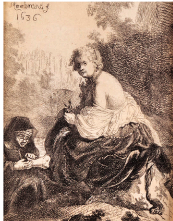
AFTER REMBRANDT VAN RIJN (1606-1669) $500-700