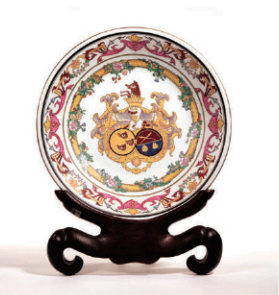
CHINESE ARMORIAL PLATE $500-700