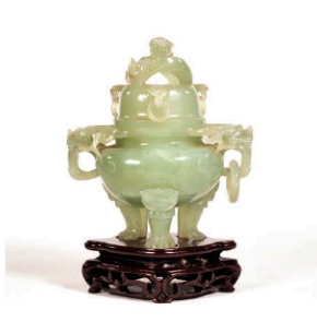
CHINESE CARVED JADE CENSER $500-1,000