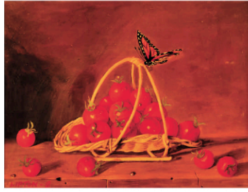
SONDRA LIPTON (20TH CENTURY) $300-500