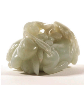
CHINESE CELADON JADE FIGURAL GROUP $400-600