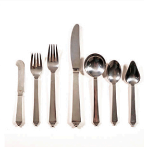
GEORG JENSEN PYRAMID FLATWARE $4,000-6,000