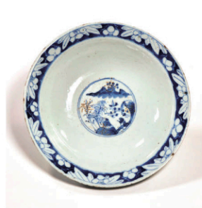
CHINESE FOOTED LOW BOWL $200-400