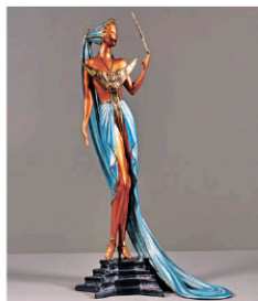
ROMAIN (ERTE) DE TIRTOFF (1892-1990) $800-1,200