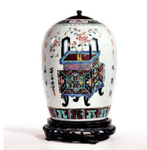
CHINESE LIDDED JAR $400-600