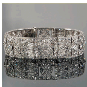
FRENCH ART DECO DIAMOND BRACELET $15,000-25,000