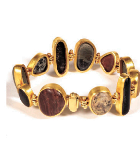
SHAW JEWELRY 22K SPECIMEN BRACELET $800-1,200