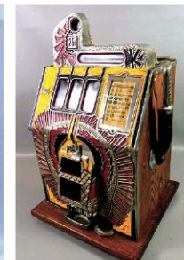
Mills slot machine