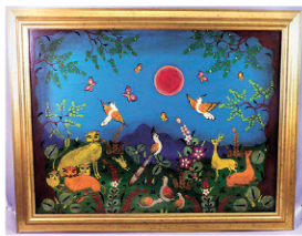
Reyes folk art painting