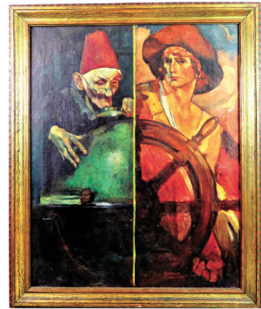
FEATURE Norman Rockwell painting

Quality items from SE Mass, Cape & Islands homes.