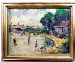
Impressionist oil painting