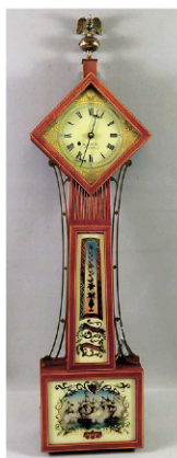
Wayne Kline banjo clock