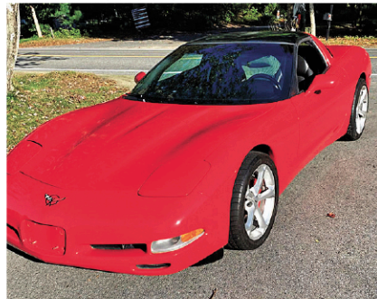
1998 Corvette - 97k miles