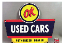
Old porcelain auto sign