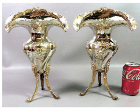
Fine French c. 1840 silver vases