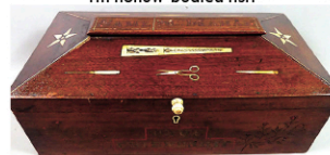
Fine 1864 id'd & inlaid box