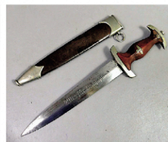
German dagger - Heller