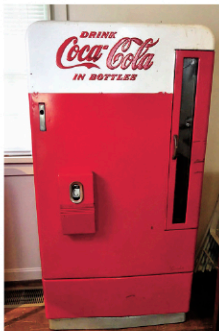
Coca Cola collectibles