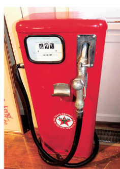
Tokheim gas pump