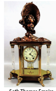
Seth Thomas Empire clock