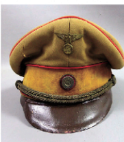
Gau German hat