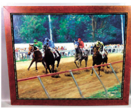
Two Micarelli horse race paintings