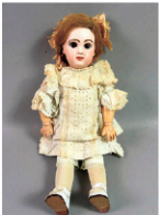
Tete Jumeau doll