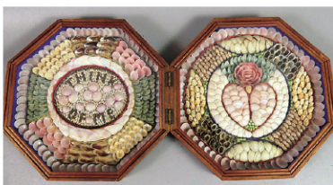
Seashell valentines (1 of 3)