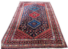
Antique Oriental rug