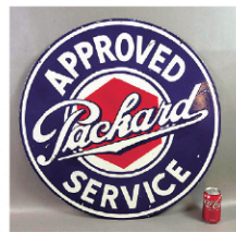
Antique Packard sign