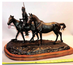
R. Steffen & other bronzes