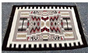
20 Navajo rugs