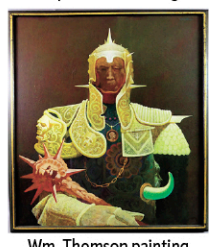
Wm. Thomson painting (1 of 12)