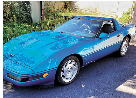
1994 Corvette - 84k miles

SPECIAL INTEREST: 2 Chevy Corvettes - 1998 red Coupe (97k mi); 1995 blue Coupe (84k mi) – both fine condition.