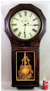
Railroad regulator clock