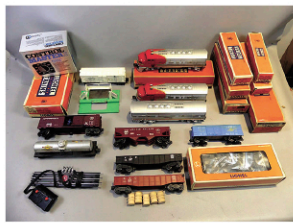
Many old train sets