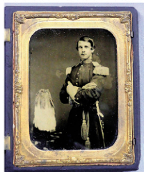
Fine early photography