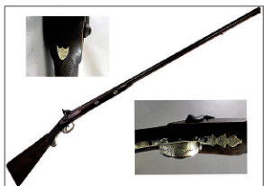
1799 silver mounted Mortimer shotgun