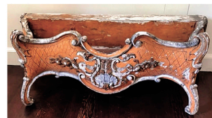
Early carved French planter

SESSION 1 AT 2:30 PM RUGS AND CURIOSITIES: 10+ Oriental Rugs, Paisley, piano shawl, vintage clothing lot, Joel Kershner signed lithographs, Contemporary ship model, and many other interesting lots.