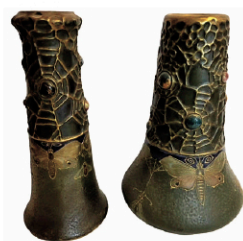
2 Amphora Vases Semiramis with web and butterflies and inset stones