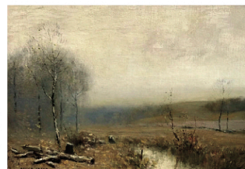
"A Waning Year" o/c signed Bruce Crane 14" x 18"