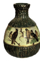
Wonderful Amphora Vase with wide band of birds and branches (approx 19")