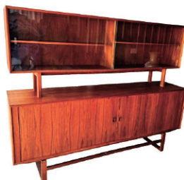
MCM Mobler Credenza