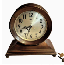
9" Bronze Base and Ball Chelsea Ship's bell clock "Constitution" 161113