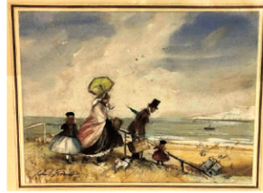
"Path to the Beach" w/c John S. Goodall