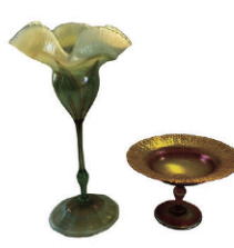
Tiffany Favre Art Glass