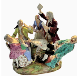
Meissen 11" "Interrupted Card Game" figural group