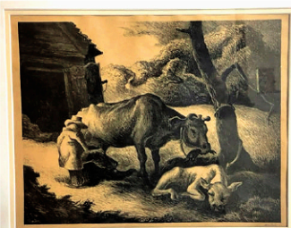
Thomas Hart Benton pencil signed "White Calf"