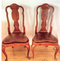
6 inlaid Dutch Marquetry chairs