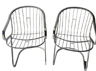
Pr. Chrome chairs design of Gastone Rinaldi