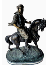
30" Arab on horseback signed Barye