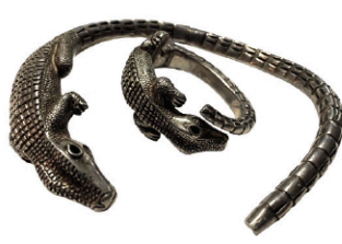
925 Sterling silver alligator choker and bracelet as well as other unusual silver jewelry and tribal belts