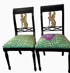
4 Black Ebonized chairs with sphinx backs