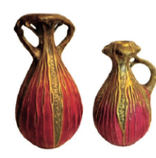
Beautiful pair of Amphora pink and gold linear art pottery vases