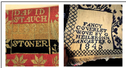
2 full size Jacquard homespun coverlets signed