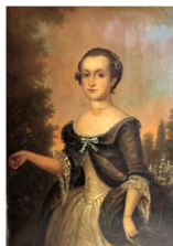
Oil portrait laid on canvas of elegant lady 42" x 42"