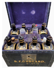
B.F. Goddard MVM gilt bottle antique leather drinks box

We are pleased to offer a Fine Two Session Antique Estates Auction featuring fine eclectic and quality selection of Antique American, English and French style furniture, fine porcelain and pottery, decorative accessories, nice silver, art, and much more drawn from partial contents of fine stately Newport home, Boston area collector, Hingham, Brookline, Sherborn and Hopkinton homes with selected additions. Items from local estates arrive after deadline. Many diversified and fresh to the market offerings.