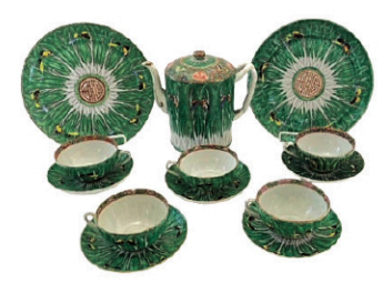
Chinese Export lot Cabbage leaf