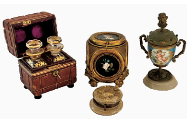
Decorative estate lot with Pietra Dura, scent bottles etc.