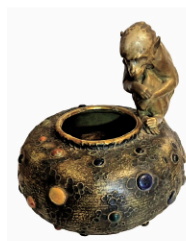
15" Amphora Pottery with inset stones stamped Amphora, Crown, Austria Eisner & Kessel