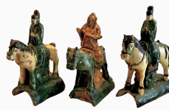
3 Chinese Equestrian roof ornaments