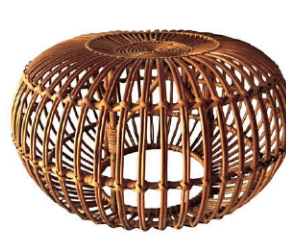
Franco Albini designed Italian Rattan Ottoman "Pouf"