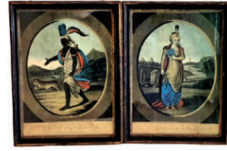
2 hand colored Mezzotints Emblems of Africa and Asia, A. Testi #30 Leather Lane, London 14 x 9 3/4"