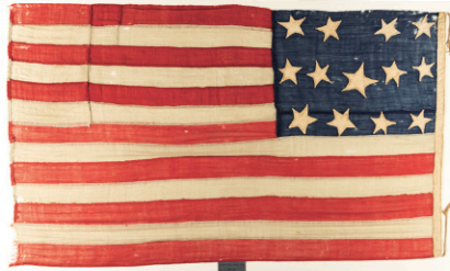
Sandy Point Lighthouse 13-Star Flag An Important Original C. 1790 13-Star Flag with Known History

FEATURING SELECTIONS FROM THE ICONIC ZARICOR FLAG COLLECTION