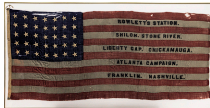
A Historic Civil War Battle Flag from the 32nd Indiana