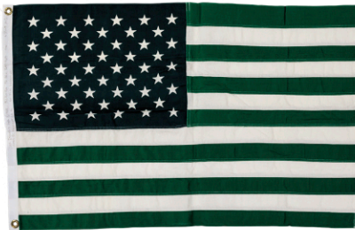
An Early 1960s Flag Celebrating Both the Peace and Ecology Movements