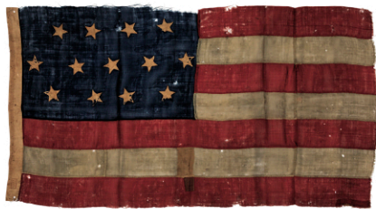
An Early 1861 Iteration of the Iconic Confederate First National Flag