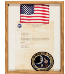
An American Flag Carried to the Moon on Apollo 14 by Astronaut Edgar Mitchell