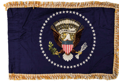
A Documented Official Limo Flag from the Presidency of John F. Kennedy