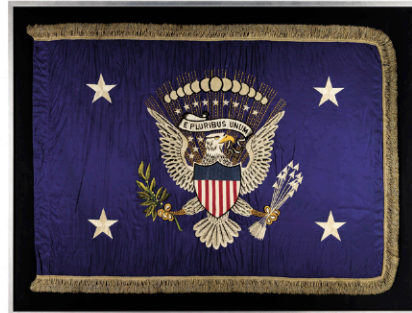
Official Presidential Flag Displayed at the White House During the Term of Franklin D. Roosevelt